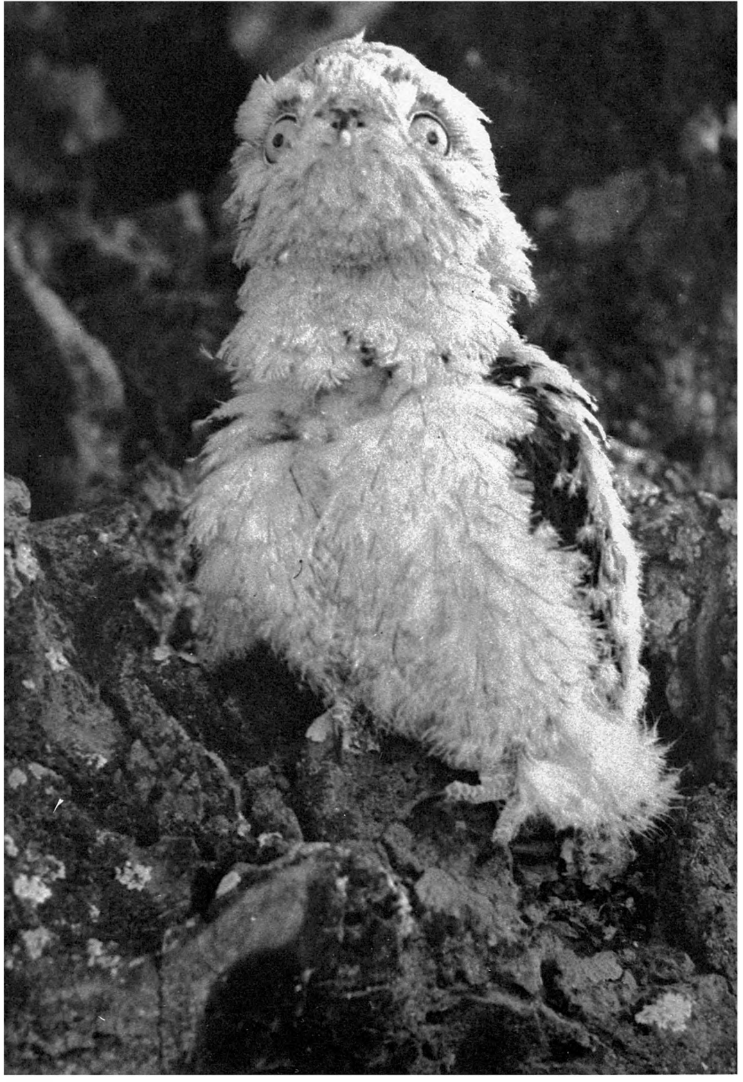
Figure 3. A young potoo, probably three weeks old, photographed on its nest, a slight depression in a broken branch.