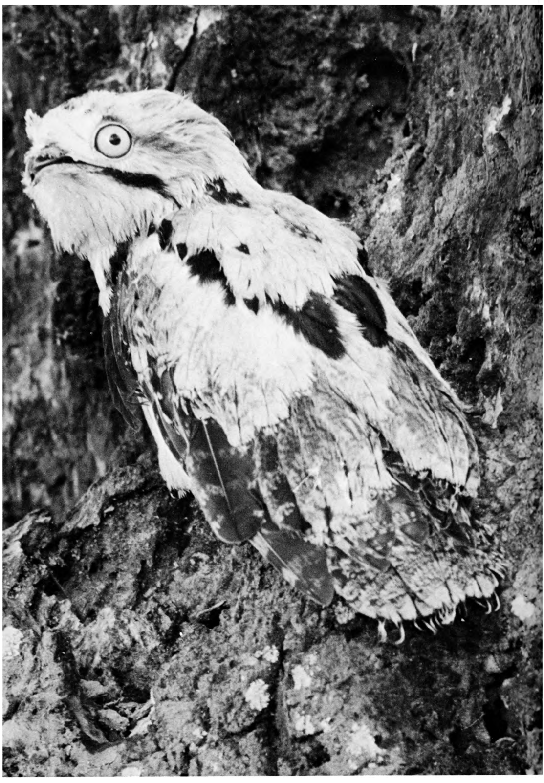
Figure 5. At about six to seven weeks of age, this bird flew from the nest when I climbed the tree to photograph it.