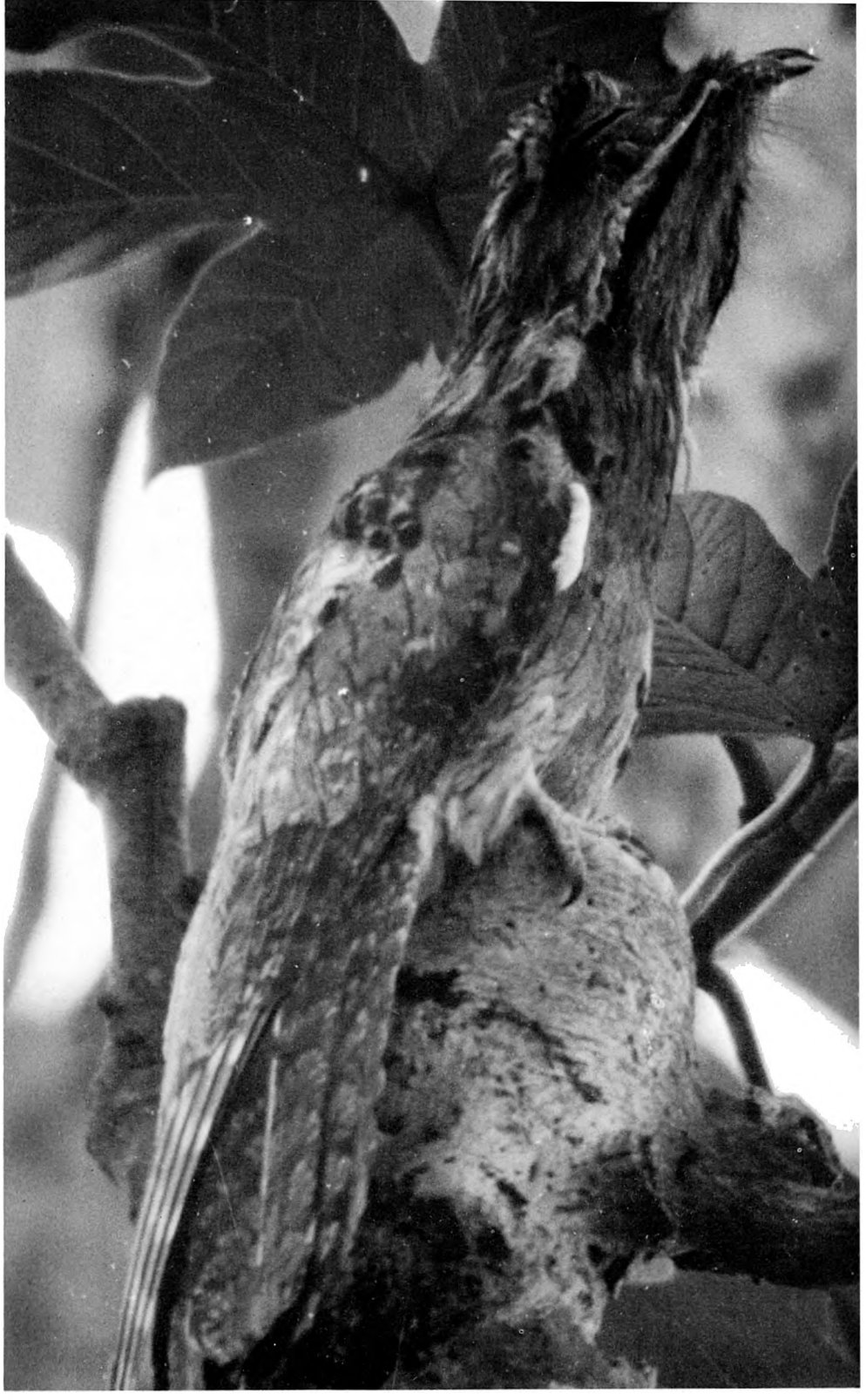
Figure 1. A Common Potoo sits in a cryptic posture, its mottled plumage simulating the bark of the tree.