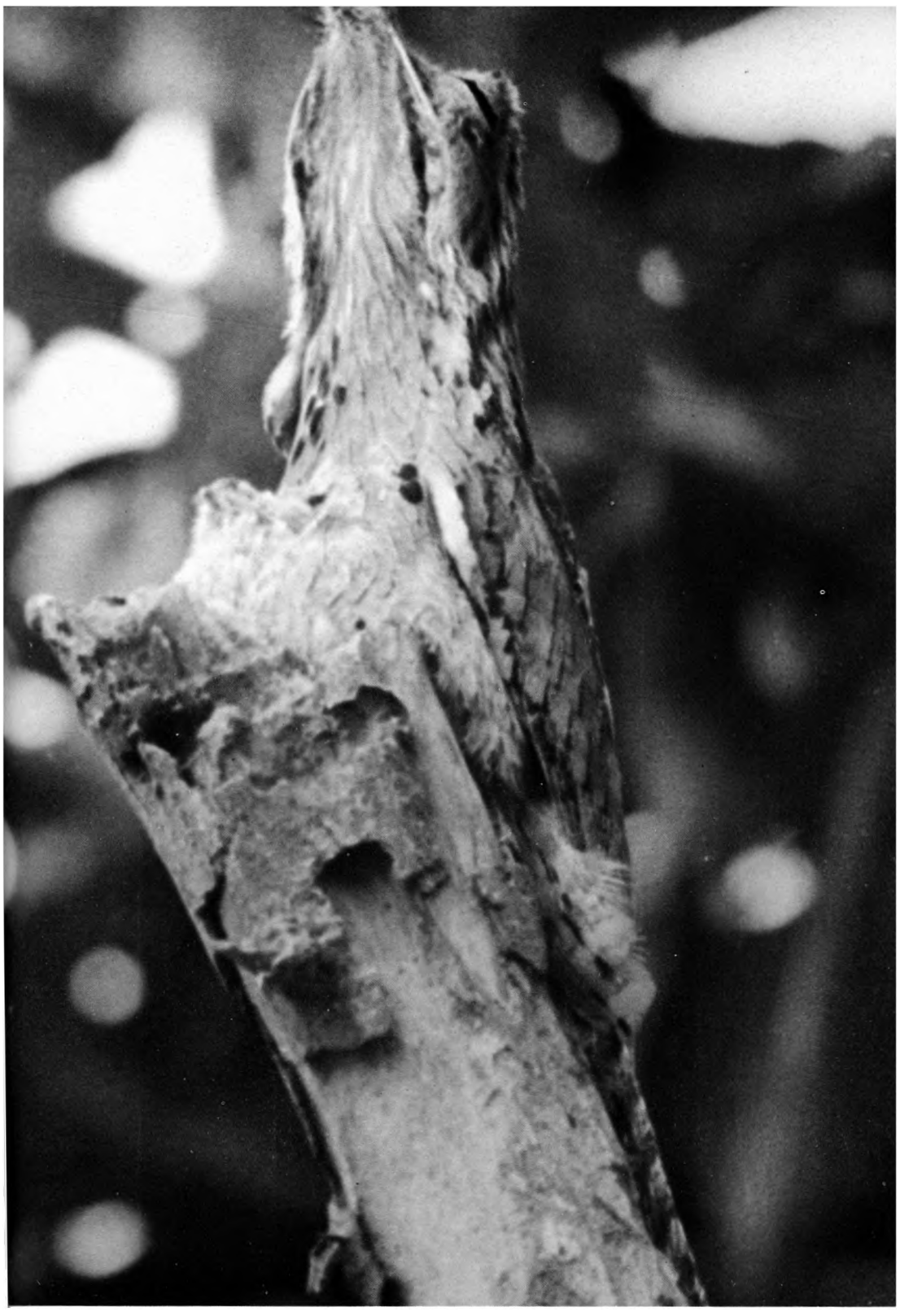
Figure 2. Another potoo appears to be an extension of the branch on which it rests. A single chick can be seen sitting in front of the adult.