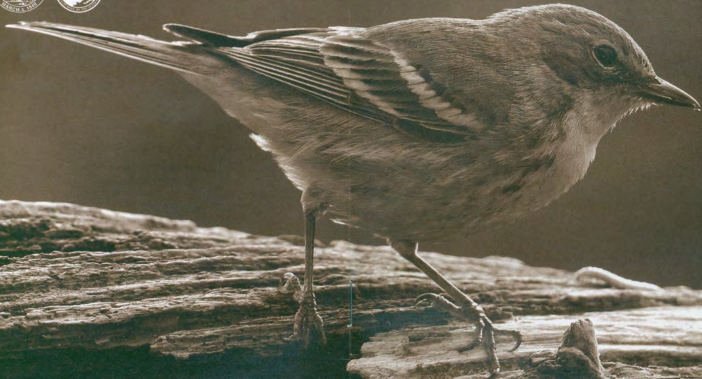
Pine Warbler