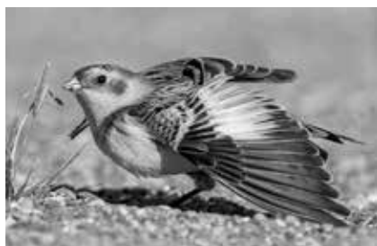
Mark Hsu snapped this close-up of a Snow Bunting feeding along the beach at East Fork on 14 Nov.

Inga Schmidt's two at LaDue on 24 Oct were the first. Jen Brumfield saw about 130 at Burke Airport on 19 Nov, Victor Fazio III counted 128 at Conneaut on 09 Nov, and there were two other triple-digit reports. (22 counties)