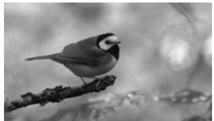
Though they're typically shy, this Hooded Warbler struck a lovely pose for photographer Mike Horn in the Franklin section of Blacklick Woods MP on 03 Oct.