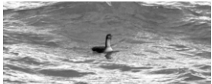
Irina Shulgina discovered this Pacific Loon in the choppy waters of Huron, Erie , on 29 Nov, and successfully documented the diagnostic chin strap.

A tantalizing late Nov report came from Tappan Lake, Harrison , but the viewers are only comfortable with calling it a distant, wave-hampered "good candidate".