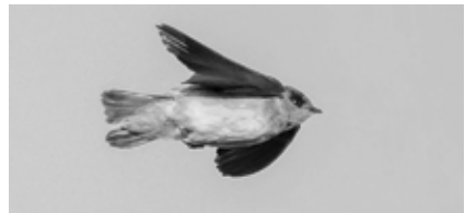
A perfect combination of weather systems provided a rare flood of Cave Swallows into northern Ohio in Nov. Alex Eberts aced this flight shot on 20 Nov in Erie .

There were eBird entries from Cuyahoga , Erie , Geauga , and Richland and reports to other venues from Lake . The OBRC will evaluate those which included enough information.