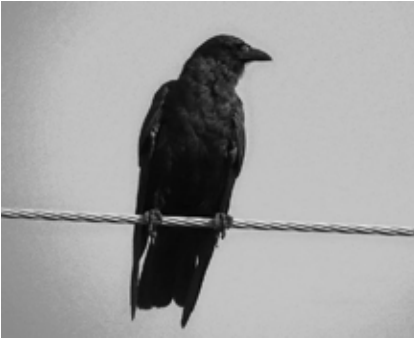
Lori Brumbaugh photographed this Fish Crow, one of three she found perched on a wire in Garfield Heights, Cuyahoga , on 08 Sep.

Multiple reports from Cuyahoga added up to about 18 birds. Other reports came from Meigs and Summit . The OBRC will sift through the evidence.