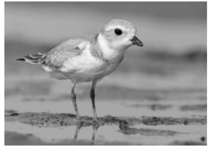
Alex Eberts found this engaging Piping Plover a noteworthy subject at Conneaut on 15 Aug.

One spent from 12 to 25 Aug at Conneaut; the OBRC will acknowledge all who provided formal reports.