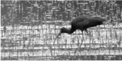
Su Snyder well documented this White-faced Ibis near Funk on 26 Jun.