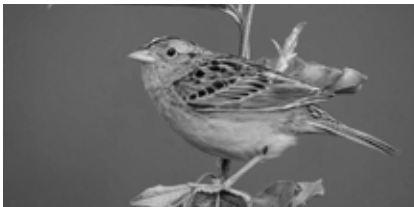
This Grasshopper Sparrow posed beautifully for Allan Claybon on 09 Jun at OOPMP.

One by Bodi Road, Ottawa , on 03 Jun (Mark Shieldcastle)