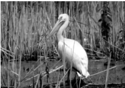
Su Snyder found an American White Pelican posing coyly along the ONWR auto tour route on 18 Jul.

Birders found up to 18 at or near Metzger between 11 and 17 Jun, and up to eight had been seen at East Harbor between 02 and 10 Jun — were they the same birds? Linda Osterhage found the only bird away from Lake Erie; it was all the way south at Lost Bridge on 30 Jun. Erie , other Lucas sites, and Ottawa provided the rest of the sightings.