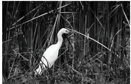
This cooperative Cattle Egret paused for a nice image at ONWR on 25 Aug.

Two spent from 25 to 28 Aug in the small pool by the ONWR entrance (m. obs.). One was there on 22 Sep (ONWR eTT). The last wandered among several vantage points along the Great Miami River in Montgomery from 14 to 16 Nov (m. obs.). Other sightings came from Ashtabula, Clermont, Erie, and Hamilton .