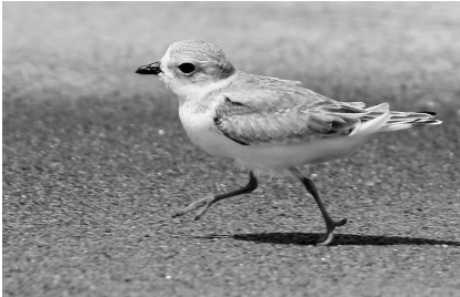
Chuck Slusarczyk, Jr. discovered and beautifully documented this unbanded juvenile Piping Plover on 13 Aug at Headlands.

Reports went to the OBRC from Lake and Ottawa .