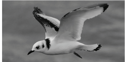
This first-winter Black-legged Kittiwake, photographed on 24 Nov by Chuck Slusarczyk, Jr., was an entertaining addition to the gull circus at the 55th Street Marina, Cuyahoga .