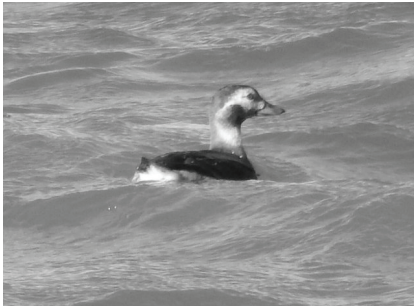
East 55th Street, Cuyahoga , featured a nearby female Long-tailed Duck that posed for Bob Lane on 14 Nov.

The first of the season's unusually high number of these visitors flew past Sunset Park with some scoters on 25 Oct (Kent Miller). One spent from 13 to 29 Nov along the Lake Erie shore from downtown Cleveland to Sims Park (m. obs.); occasionally a second was also seen and of course the sightings could actually have been of several individuals. Two flew past Huron, Erie , on 22 Nov (Robert Hershberger). The only bird south of mid-state hugged the Ohio bank of the Ohio River at Meldahl Dam, Clermont , on 20 Nov ( fide Brian Wulker). More reports of single birds came from additional sites in Lake plus Ashtabula , Delaware , Geauga , Muskingum , Paulding , Trumbull , and Wyandot .