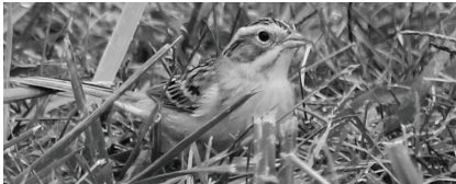
Chuck Slusarczyk, Jr. astutely identified and documented this Clay-colored Sparrow in a flock of Chipping Sparrows in the parking lot near CLNP on 05 Sept.

Jen Brumfield found about 160 at CLNP on 25 Oct and Samir Apte noted 100 the next day. The most elsewhere were 80 at Woodland Cemetery, Montgomery , on 15 Sep (Amanda Lawson). Sixty-eight counties provided reports.