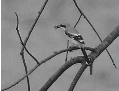
Jen Brumfield spotted and obtained documentation photos of this wary Loggerhead Shrike as it hunted grasshoppers on 09 Sept along Wilderness Road.

Some of the several reports from Wayne had enough detail for the OBRC to evaluate.