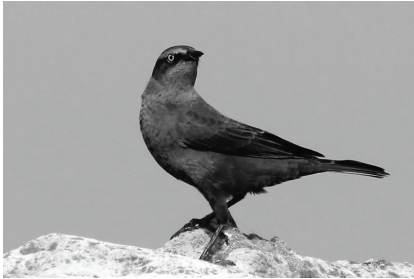
Birding Cleveland Harbor on 15 Oct rewarded Chuck Slusarczyk, Jr. with a lovely photo-op of this migrant Rusty Blackbird.

Four at Station Road in CVNP (the Chasars) and one at Wilderness Road (Tom Bain) on 19 Sep were the first. On 02 Nov Kent Miller watched “large flocks flying steadily overhead into impoundment area [at Huron, Erie ] and beyond” which totaled about 500 birds. CPNWR hosted a flock of about 140 on 16 Nov (Elliot Tramer). Thirty-six counties produced reports.