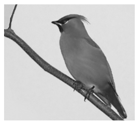
The parking lot at Maumee Bay SP was unusually busy on 02 Dec 2012, filled as it was with enthusiastic birders sporting spotting scopes, binoculars, and large lenses all focused on a flock of Bohemian Waxwings.

central and southern counties. The species was statewide, however: 71 counties had sightings.