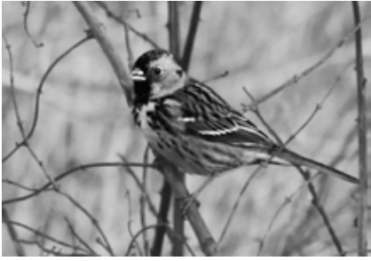
This wayward Harris's Sparrow was a life bird for many enthusiastic new birders during its several months of viewing opportunities at the Pickerington Ponds feeders.