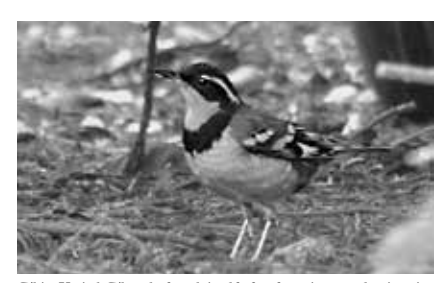
This Varied Thrush found itself far from its usual wintering grounds in the far west, and was photographed in Avon Lake, Lorain, by Chuck Slusarczyk on 07 Dec 2012.

An extraordinary sighting was reported during the 22 Dec Portsmouth CBC, Scioto , with "good documentation" which was not made available to the Cardinal .