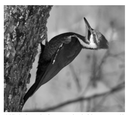
A hike in the woods after trees are bared of leaves can provide stunning winter views of Pileated Woodpeckers. Allan Claybon captured this image on 30 Dec 2012 at Cowan Lake, Clinton.

A hybrid of uncertain parentage was near Pipe Creek WA, Erie , between 09 and 16 Dec. The OBRC has photographs and testimony.