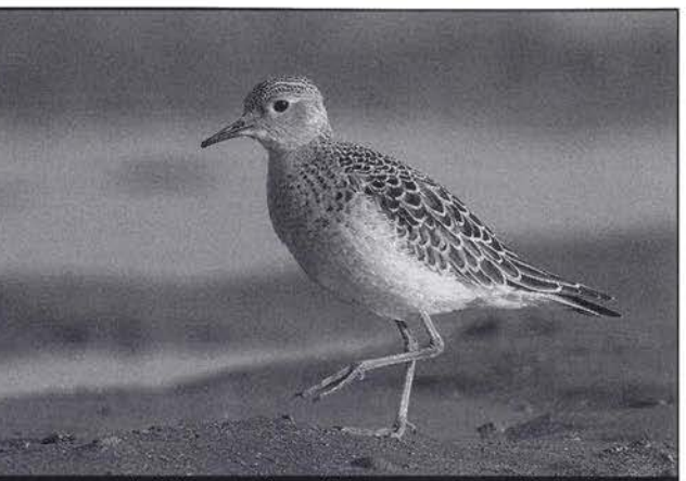
A gorgeous buff-breasted sandpiper struts its stuff on the early morning beach 4 Sept. at Conneaut.

sound and sight of a peregrine stooping on a juvenal Hudsonian godwit, a blacknecked stilt foraging in snow flurries, 43 American golden-plovers arriving in one fell swoop, American avocets and willets, whimbrels and red knots, and 28 striking adult ruddy turnstones—in fall! Buff-breasted sandpipers from the west have put on yearly cameos here in easternmost Ohio. Long-distance purple sandpipers,