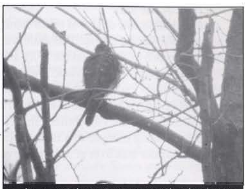
Merlin 4, at Calvary Cemetery in Cleveland. Note the upperparts markings that distinguished it from Merlin 2.

On 23 March 2004, merlin 1 was in his pre-roost tree. Merlin 2 was in Section 74; I stopped to observe her,