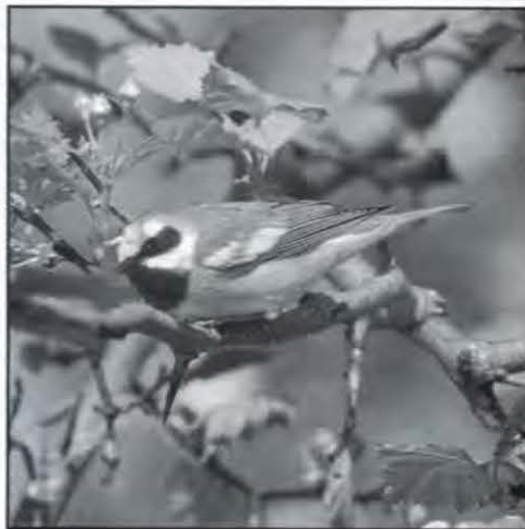
The lower Shaker Lake area of Cuyahoga County produced this stunning golden-winged warbler in early May. Photo by Laura Gooch on 4 May 2003.

Black-throated Blue Warbler: 30 Apr brought one to Licking (T. Nickerson) and two to Scioto Trail SF (B. Royle). Ten were at HBSP on 20 May (L. Rosche).