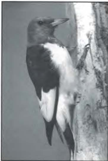
This red-headed woodpecker represented one of four different species of woodpeckers seen on the morning of 11 March 2003 at North Chagrin Reservation in Cuyahoga County.