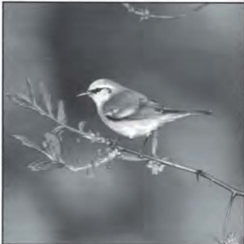
A "Brewster's" warbler joined the ranks at Cuyahoga County's lower Shaker Lake area this season.