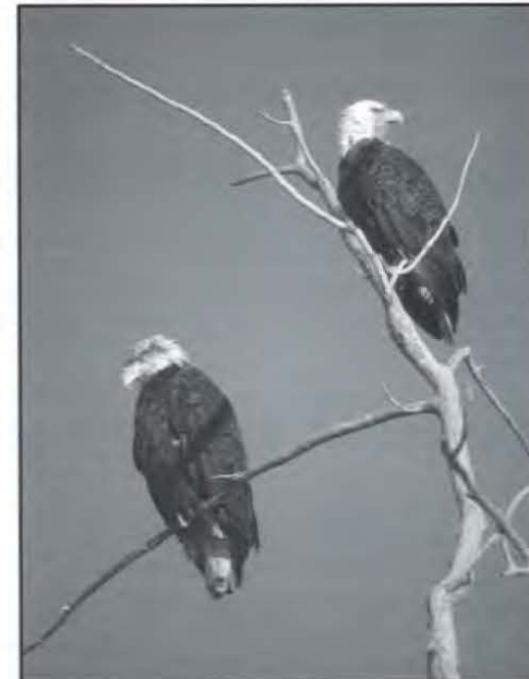
These two bald eagles surveyed Turtle Creek Wildlife Area in Ottawa County on 15 March 2003.