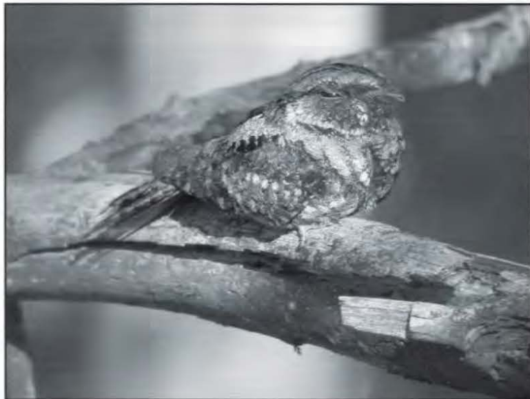
This whip-poor-will obligingly posed for a photograph in Oak Openings Preserve Metropark in Lucas County.