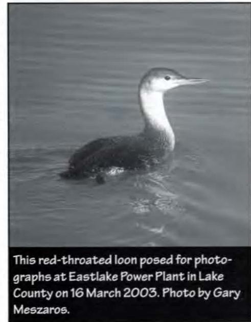
This red-throated loon posed for photographs at Eastlake Power Plant in Lake County on 16 March 2003.

In 2003 more observers were afield, and communications easier (60+ observers contributed to our 90+ reports), so comparisons as to the magnitudes of the incursions are difficult. In his summary, Harlan compared 1994's 100+ birds with only ~250 recorded in the entire previous history of Ohio ornithology, suggesting the 1994 phenomenon might have been unique at the time.