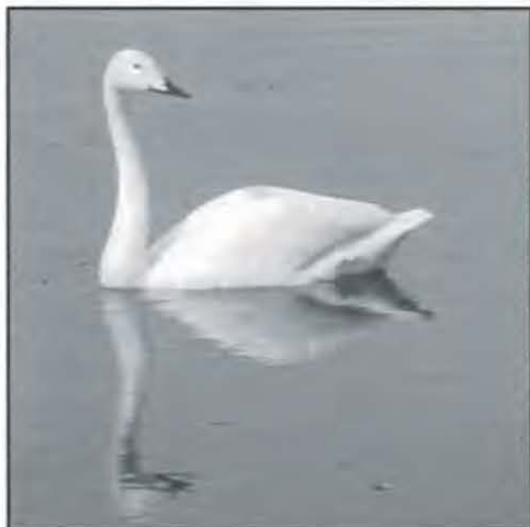
Causing quite a bit of surprise, this whooper swan appeared at the Hebron Fish Hatchery on 16 April 2003.