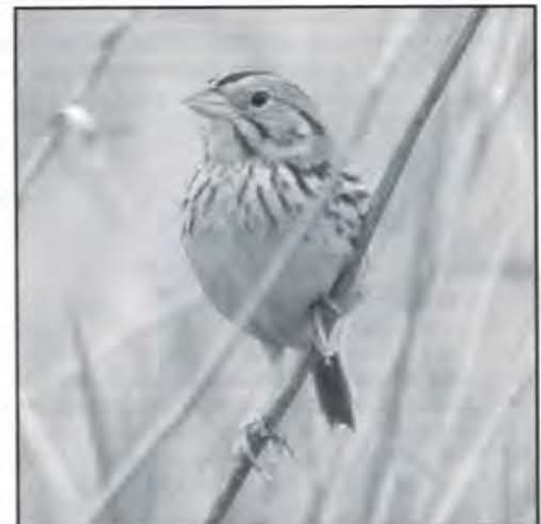
Grassland species were plentiful at the VOA grounds in Butler County this season.