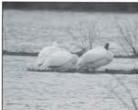
Rocky Fork State Park in Highland County hosted these four American white pelicans for several days.