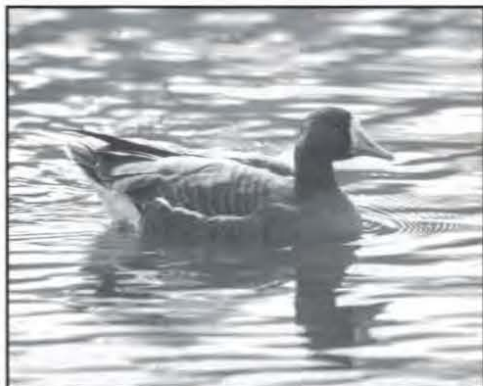
Cuyahoga County's North Chagrin Reservation hosted this greater white-fronted goose on 12 March 2003.

Wood Duck: None reported wintering, so 16 in Dayton 7 Mar may have been first arrivals (N. Smith). Birds appeared the same day in the Cleveland area (K. Metcalf).