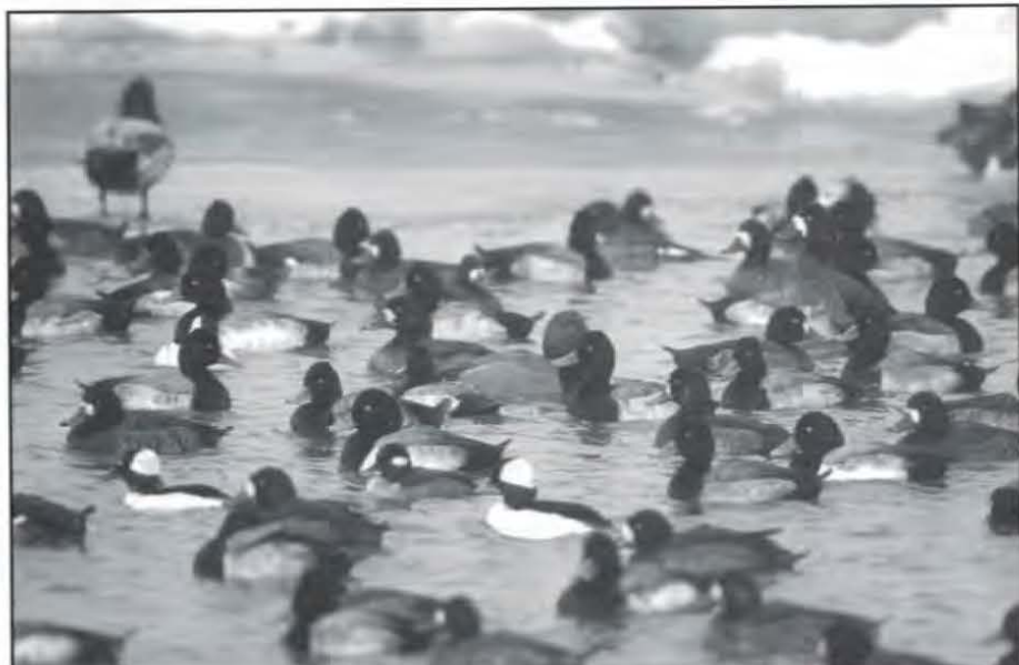
This gathering of divers was photographed at E. 72 nd Street in Cleveland, Cuyahoga County, on 9 February 2003.

Information about the Wetlands Reserve Program can be had from The Natural Resources Conservation Service at the USDA or at < http://www.nrcs.usda.gov/programs/wrp/ >. -Ed. 🐦