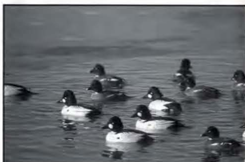
The Cedar Point causeway in Erie County hosted a photogenic flock of common goldeneyes on 23 January 2003.

Common Merganser: The largest counts were 2750 off Huron 4 Jan (B. Whan), 1150 off ONWR 6 Jan (V. Fazio), and 3650+ in Erie 13 Jan (Fazio).