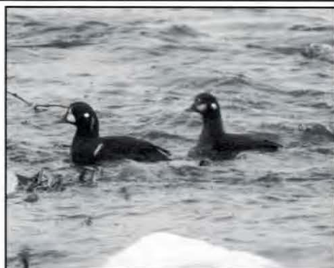
This pair of harlequin ducks spent 10 days along the Great Miami River in Dayton, Montgomery County, this season.