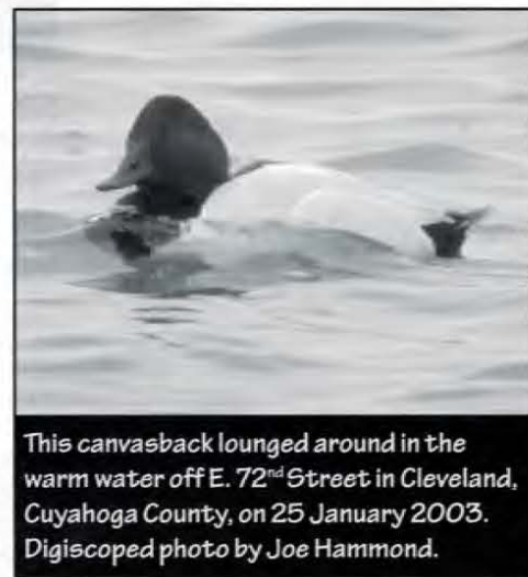
This canvasback lounged around in the warm water off E. 72 nd Street in Cleveland, Cuyahoga County, on 25 January 2003.

Lesser Scaup: High count 600+ on 4 Jan at Huron harbor ( B. Whan ), and numbers low, at least within sight of shore, even at warm-water outlets. Six or fewer were regular along the Great Miami R throughout Feb (m obs). Twenty at EFSP 26 Feb ( F. Renfrow ) may well have been returning north.