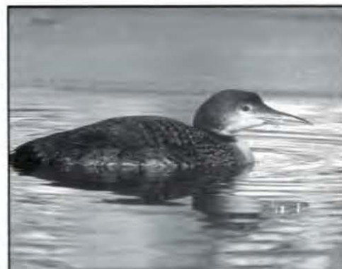
Nearly ice-bound in Cuyahoga County, this common loon was rescued and later released in Lake Erie.