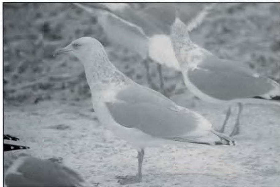
Unusual-appearing gulls were frequently encountered at E. 72 nd Street in Cleveland, Cuyahoga County, during the big freeze this season. This beast, a possible adult glaucous gull X herring gull hybrid, was photographed there in January 2003.