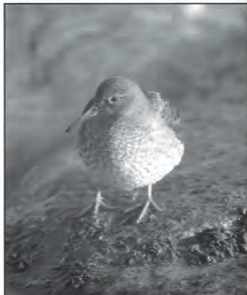
This purple sandpiper occupied the breakwall at Headlands Beach State Park in Lake County on 8 December 2002.