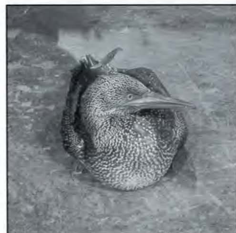
This first-year northern gannet was found in an Ashland County field on 4 December 2002. It was taken to a rehab center, but died six days later.