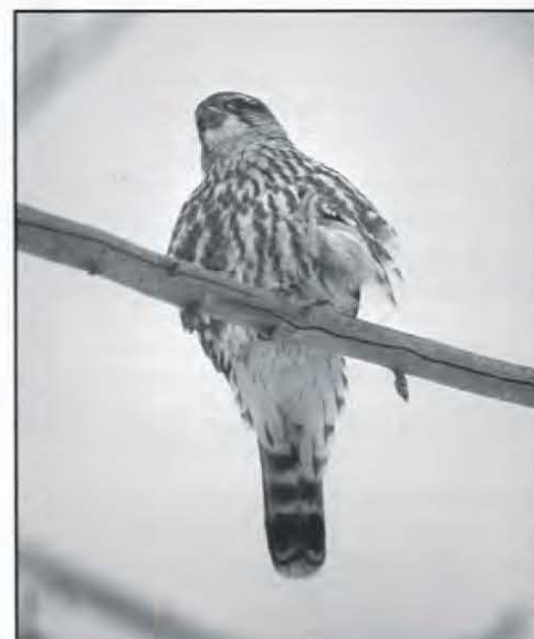
Cleveland's Calvary Cemetery in Cuyahoga County was a wintering location for up to three merlins this season.