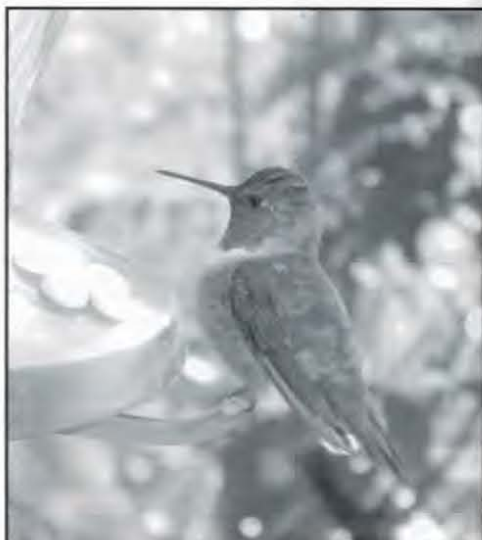
This adult male rufous hummingbird appeared at a Wayne County feeder in September and stayed throughout the season. on 7 December 2002.