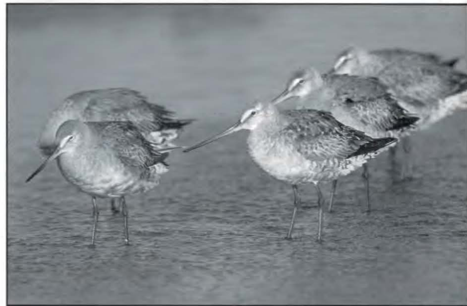
Fourteen Hudsonian godwits at Conneaut Harbor in Ashtabula County on 2 September 2002 represented the high count this season. These five birds were part of that group.