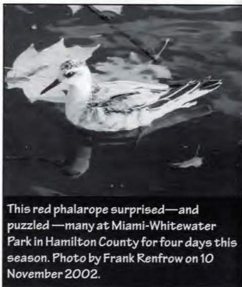
This red phalarope surprised—and puzzled—many at Miami-Whitewater Park in Hamilton County for four days this season.