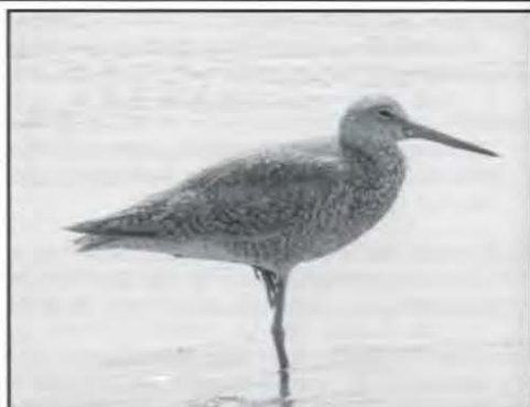
Pickerel Creek Wildlife Area in Sandusky County hosted a number of shorebirds this season, including this apparent "eastern" willet. Documented records of this subspecies are extremely rare away from the east coast. Digiscoped photo by Paul Gardner on 17 August 2002.

Hudsonian Godwit: More than 40 in 15 reports overall. Two were at the CCE 4 Aug for the ONWRC, then four 6 Oct, and a molting adult was at Conneaut 16 Aug (J. Hammond), with two adults reported the same day there by B. Royse. The high count was 14 at Conneaut 2 Sep (G. Meszaros), and last were 'several' at the CCE 2 Nov (Royse).