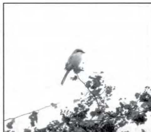
For the second year in a row, Killdeer Plains Wildlife Area in Wyandot County hosted a loggerhead shrike.