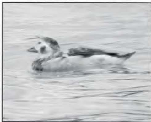
This long-tailed duck entertained many at the Eastlake power plant in Lake County this season. Digiscoped photo by Joe Hammond on 9 November 2002.