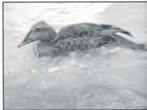
The second state record of common eider was one first seen at Fairport Harbor in Lake County on 3 November 2002, and remaining through the end of the period. Digiscoped photo by Joe Hammond on 4 November 2002.

Surf Scoter: 150+ birds, beginning with three 5 Oct at LSR ( J. Pogacnik ). Persisted from 17 Oct (three birds, P. Lozano ) through the eop at Rocky River Pk , with high count of 70-75 on 2 Nov ( Lozano ); as with other scoters, more remarkable than numbers (we had ~300 surfs in '92, 286 in '98) was their lengthy stay at this site, and the 13 counties reporting at least a few. J. Hammond notes that this scoter sp. had the only adult male he saw this fall—one, at Rocky River .