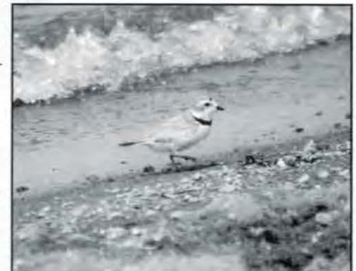
Piping plovers have become quite rare in the Great Lakes region of late. This one turned up at Buck Creek State Park in Clark County on 16 August 2002.