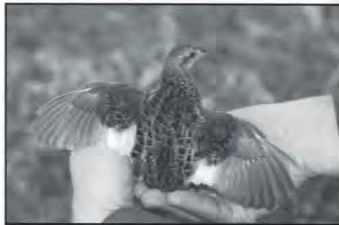
This yellow rail was discovered in a Tuscarawas County alfalfa field on 7 October 2002. Photo by Bruce Glick on that date.

Common Moorhen: Sparsely reported, mostly at ONWR, where the census had five 4 Aug, nine 1 Sep, and three 6 Oct.