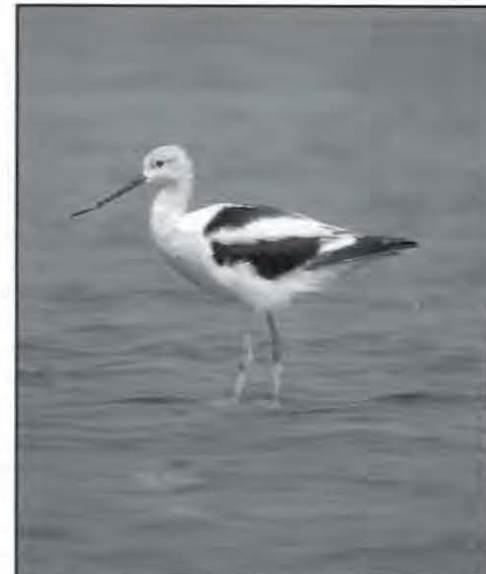
This striking American avocet was photographed at Conneaut Harbor in Ashtabula County on 11 August 2002.