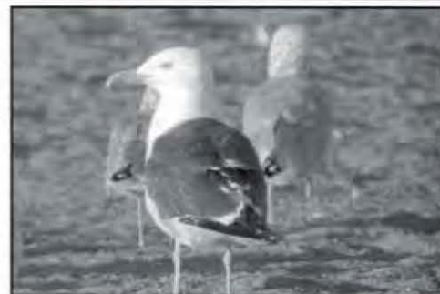
This adult lesser black-backed gull provided a very unusual inland record at Caesar Creek State Park in Warren County.