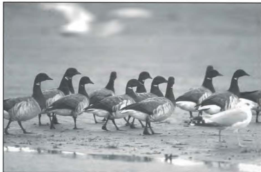
Conneaut Harbor in Ashtabula County produced decent numbers of brant this season. The birds in this photo were part of a flock of 22 present on 7 October 2002.

Blue-winged Teal: Numbers were far down by all accounts, with one triple-digit report, of 137 for the 6 Oct ONWRC. One remained for the 3 Nov ONWRC in a cold season.