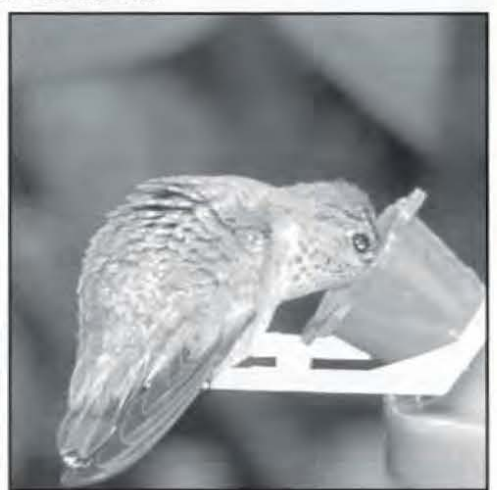
Figure 3. Immature male Calliope hummingbird in Ross County. Note long wing extension beyond tail and entirely dark spatulate-shaped central tail feathers. Photo by Bill Bosstic and Joe McMahon on 30 October 2002.

As in the case of the above-cited rufous hummingbird, interpretations from photos can vary, and first impressions may depend on the type of field experience one has. Those, like banders, who are accustomed to identifying birds in the hand often apply very different skills and corre-