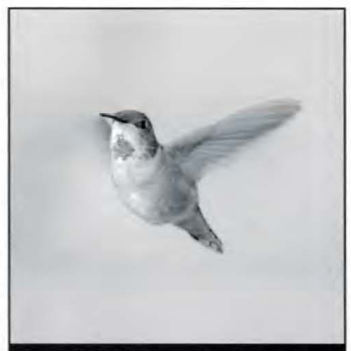
Figure 1. Adult female rufous hummingbird in Logan County. Note centrally located gorget feathers. Photo by Tim Daniel on 12 December 2002.

Identification of Selasphorus hummingbirds other than adult males is probably one of the most vexing problems facing Ohio ornithologists. Even adult males are not necessarily straightforward: up to 1-2% of adult male rufous hummingbirds, for example, have all-green backs, a feature shared by adult male Allen's hummingbirds (Howell 2002). Diagnostic features as to species of immatures, adult females, and greenbacked adult males are difficult, if not impossible, to discern without having the bird in hand. However, photographs may permit conclusive identification in some cases. In order to identify properly hummingbirds in any genus it is critical to age and sex each individual accurately. Ortiz-Crespo (1972) developed criteria for accurate