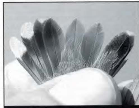
Figure 5. Tail features of the immature male Calliope hummingbird in Ross County. Note entirely dark spatulate-shaped central tail feathers. Photo by Allen Chartier on 1 November 2002.

So, was it really necessary to catch this bird to verify its identity? The authors do not think so. Given good views, Calliope hummingbird is one of the more easily identified among immature and female North American hummingbirds. The fact that most of the birders who viewed the photos (Figures 3, 4) prior to the bird's capture agreed it was a Calliope bears this out. Furthermore, observers were