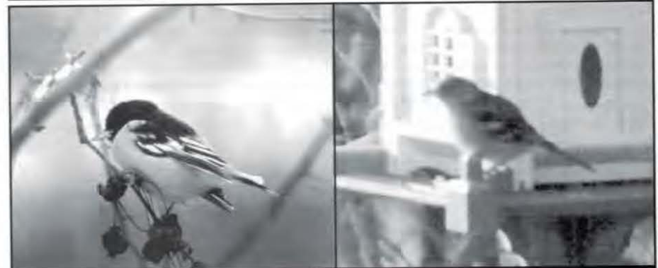
Two Baltimore orioles were present in Ohio this winter. The first was an adult male (left) at a Cuyahoga County feeder on 25 December 2001. The second, an immature male (right), visited a Montgomery County feeder from 23-30 January 2002.

Brown-headed Cowbird: Included on a big day for black birds were a record 10,770 on the 6 Jan Ottawa CBC.