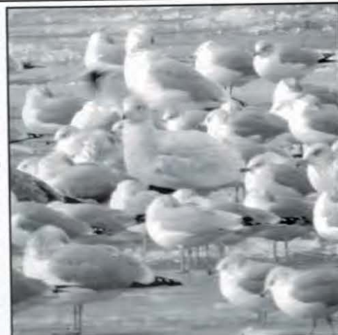
Standing head-and-shoulders above the crowd, this first-winter glaucous gull made its presence known at Lorain Harbor in Lorain County on 5 January 2002.