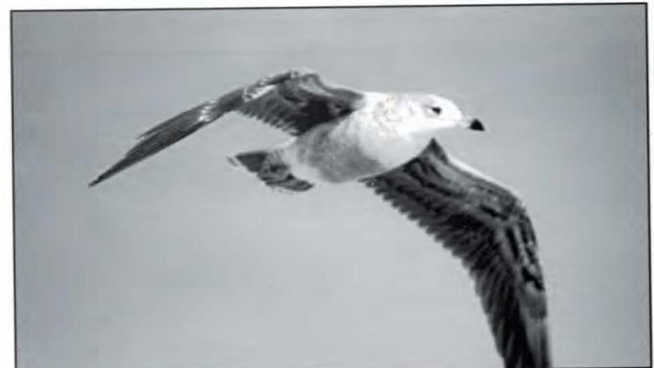
This apparent ring-billed X laughing gull hybrid spent over two weeks at Kelleys Island in Erie County during January. Vic Fazio took this photo on 12 January 2002, the day the bird was discovered.

Black-headed Gull: A basic-plumaged adult on 20 Dec at Lorain harbor ( S. Zadar ) may well have been one seen for the local CBC on 24 Dec and the following day ( J. Pogacnik et al.). Details are with the OBRC. Details were also furnished for another bird found 30 Dec at Fairport Hbr ( L. Rosche et al.).