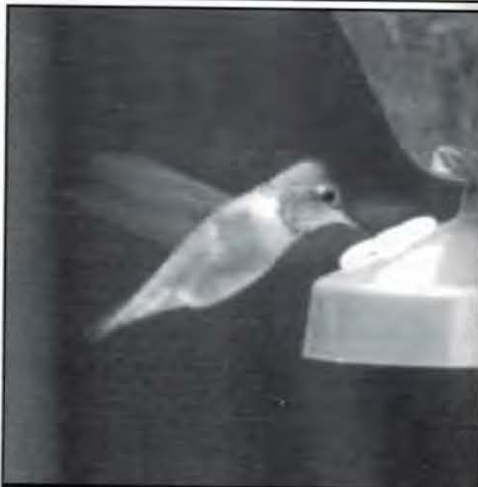
Selasphorus hummingbirds almost always cause a stir wherever they appear. This one frequented a Cincinnati feeder in Hamilton County during December.