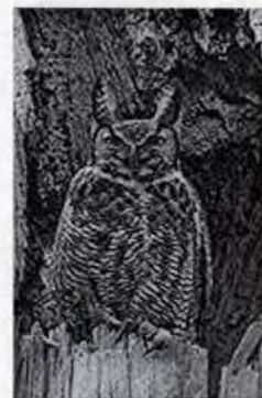
The Great Horned Owl nest at Crane Creek S.P., Lucas Co. in its 4th year

Ever since the Ohio Breeding Bird Atlas Project, Ohio birders have discovered the excitement of revealing the local nesting scene. These efforts were particularly rewarding in the Canadian zone habitats of the state as the cool summer gave impetus for northern breeding species to nest in substantial numbers in known localities and others to find themselves in new territories. The Lake County and Franklin County Metropark surveys are detailed in this issue. Among the species likely responding to the cooler season were high numbers of Winter Wren in Lake County, while the nesting of White-throated Sparrow and Black-throated Blue Warbler were the first successful nestings since 1931 and 1932 respectively. During the Atlas some evidence suggested Chestnut-sided Warblers were expanding their range slowly to the southwest within Ohio. This year first successful nestings in the Dayton and Columbus Metroparks area continue that trend. Pied-billed Grebes have responded to newly created wetlands. The species now regularly nests in the Columbus area and has recently taken up summer residence near Cincinnati. Shifting populations, both in the short term and long term, continue to provide for future discoveries. Species to watch