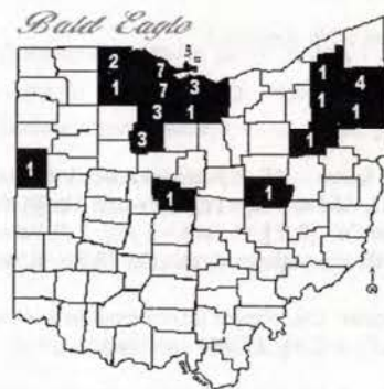
Active nest sites in 1997, fide O.D.N.R., D.O.W.

Northern Harrier All Reports : 4 June - mid July, 1 @ Woodbury W.A., Cochocton Co. [R.Ro.]; 6 June - 10 July, 3 @ Killdeer Plains W.A., Wyandot Co. [J.H.]; 8 June, 1 m. @ Mosquito L., Trumbull Co. [C.H.]; 30 July, 1 @ Units DF, Big Island W.A., Marion Co. [census, N.M.]