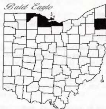
Active nest sites 1982-87, Ohio Breeding Bird Atlas

Bald Eagle Local Interest : 10 June, 1 imm. @ Chapin Forest, Lake Co. [J.P.]; 21 June, 1 @ Hocking Co. [D.O.]; 2 July, 1 imm. @ Lorain impoundment, Lorain Co. [T.LP.]