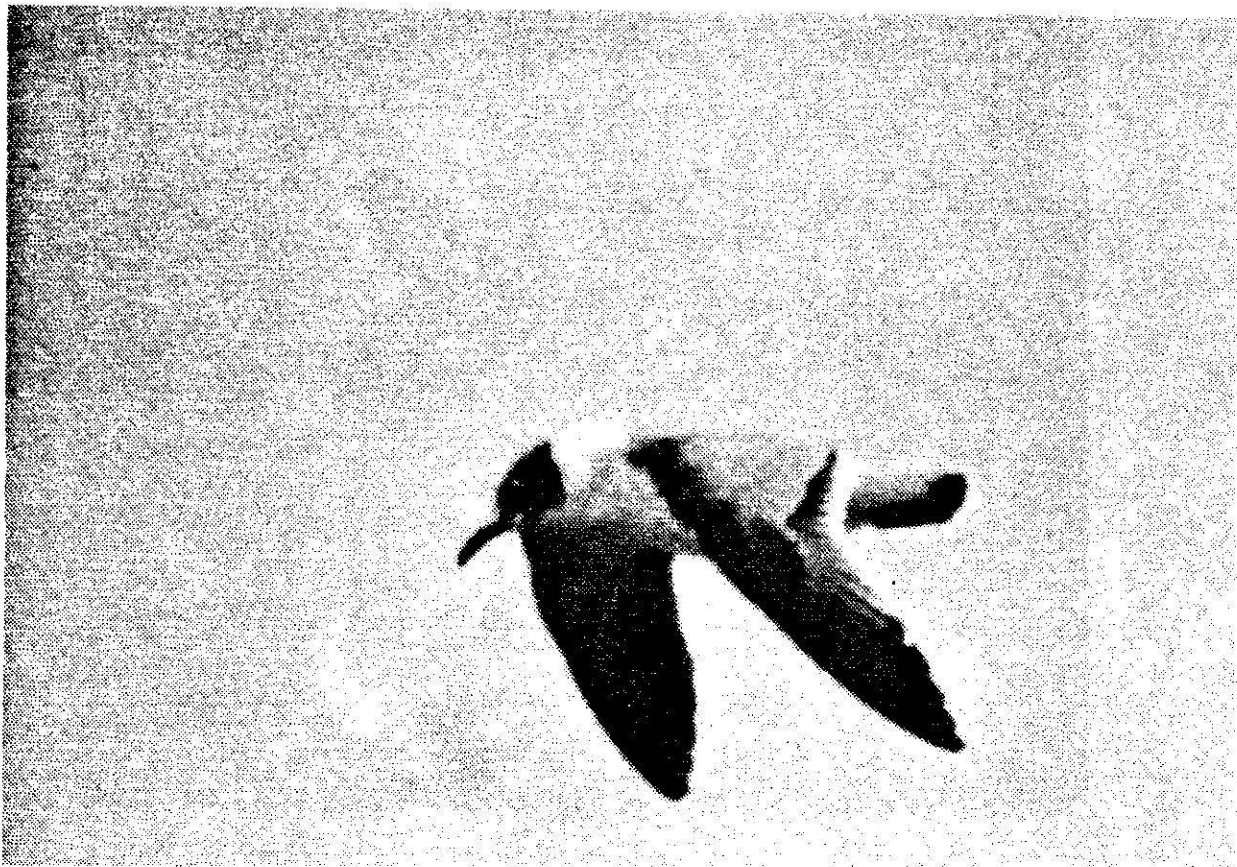
Franklin's Gull. November 1978. Wildwood Park (Cleveland). -----