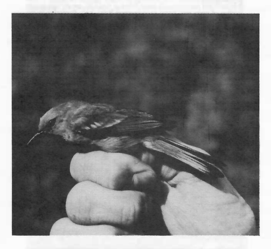
Blue-winged Warbler. Oak Hill, CVNRA (Summit Co.), June 14, 1995.