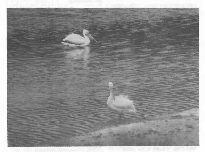
Am. White Pelicans. Willoughby (Lake Co.), June 9, 1995.

Blue-winged Teal- A nest was found at MWF 7/23 (PW). Potential nesters include: -41-Magee 6/18 (HSH); 23