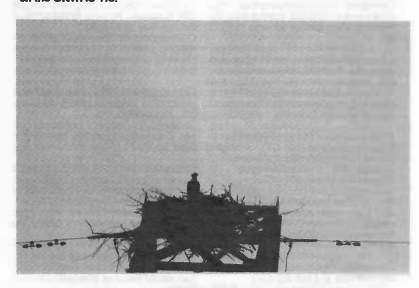
Osprey nest. Rayland (Jefferson Co.), August 7, 1995.

Gray-cheeled Thrush- 3 spring laggards were banded at Lakeshore MP [hereafter Lish] (Lake) through 6/4 (JP).