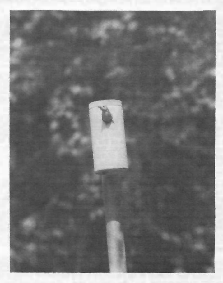
Prothonotary Warbler at artificial nesting structure along the upper Cuyahoga River (Geauga Co.).