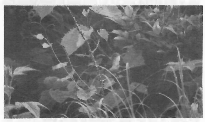
Bell's Vireo. Claridon Prairie (Marion Co.), June 25, 1995.