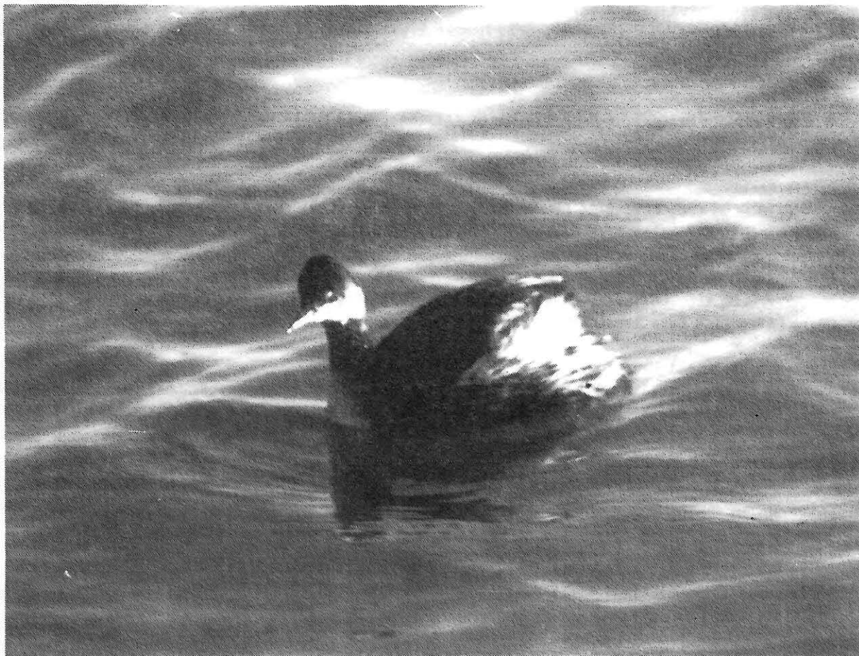
Winter plumaged Eared Grebe photographed November 28, 1987, at Headlands State Beach Park (Lake Co.) by Larry Rosche.