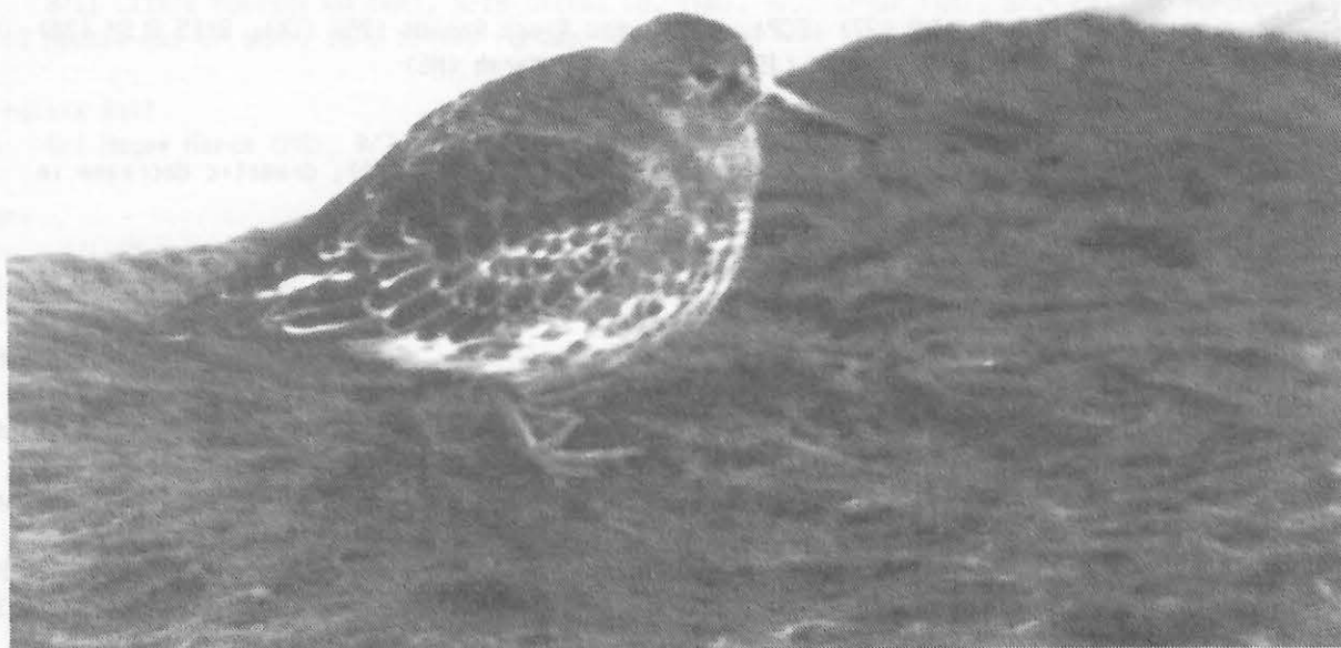
Purple Sandpiper photographed November 28, 1987, at Headlands State Beach Park (Lake Co.).

8/22 Gordon Pk. (RH), 8/29 Gordon Pk. (5) (RH), 9/5 Ottawa Co. (4) (KA), 9/13 Maumee River Rapids (TK), 9/14-21 Huron (2) (KA), 10/2 Ottawa Co. (KA), 10/6 W. Branch SP (LR), 10/11 CJ Brown Res. (DO), Late: 11/28-29 Buck Creek SP (DO)*