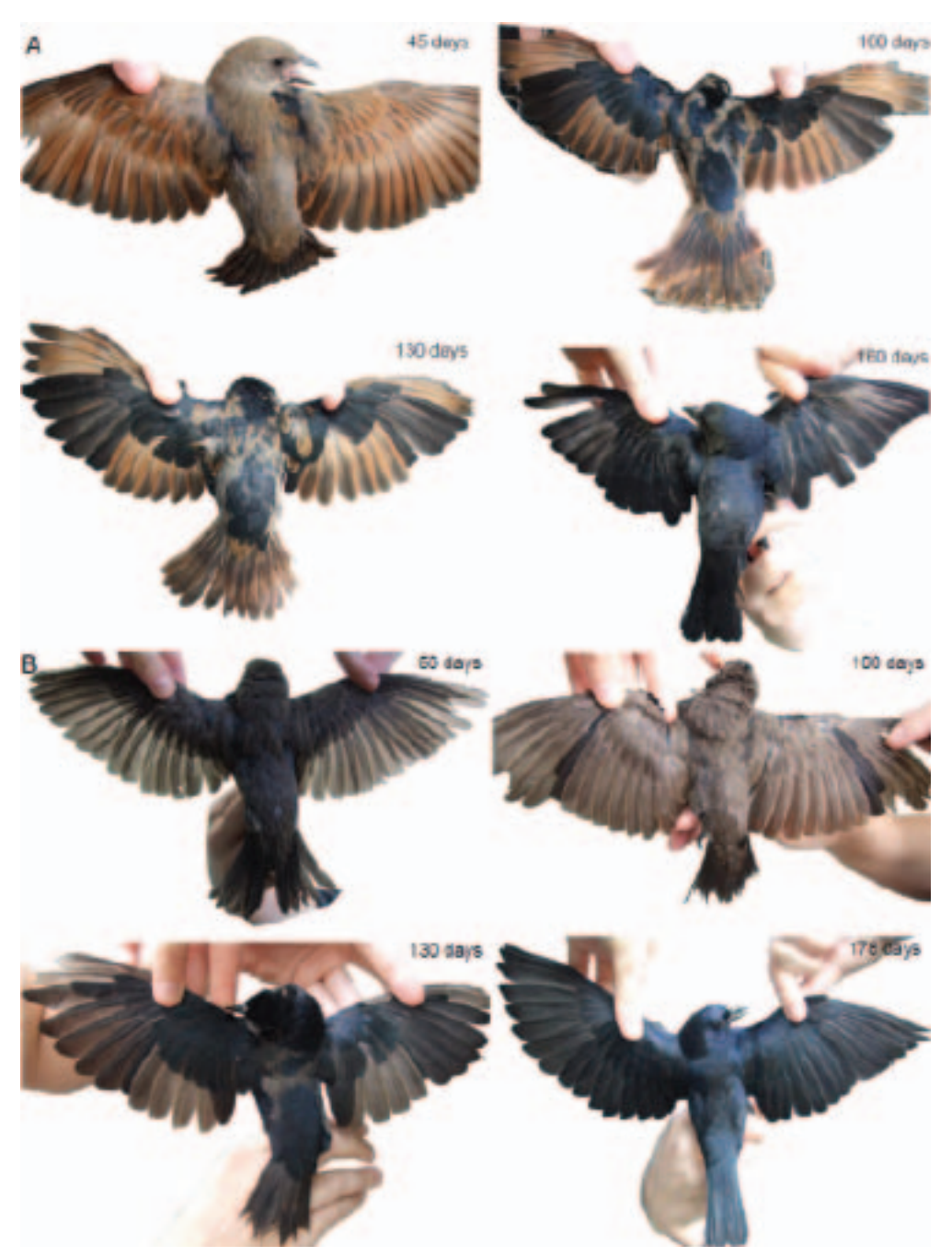
FIG. 3. Sequence of first preformative molt. Photographs of (A) Screaming Cowbirds and (B) Shiny Cowbirds at different stage of plumage maturation (days of age).