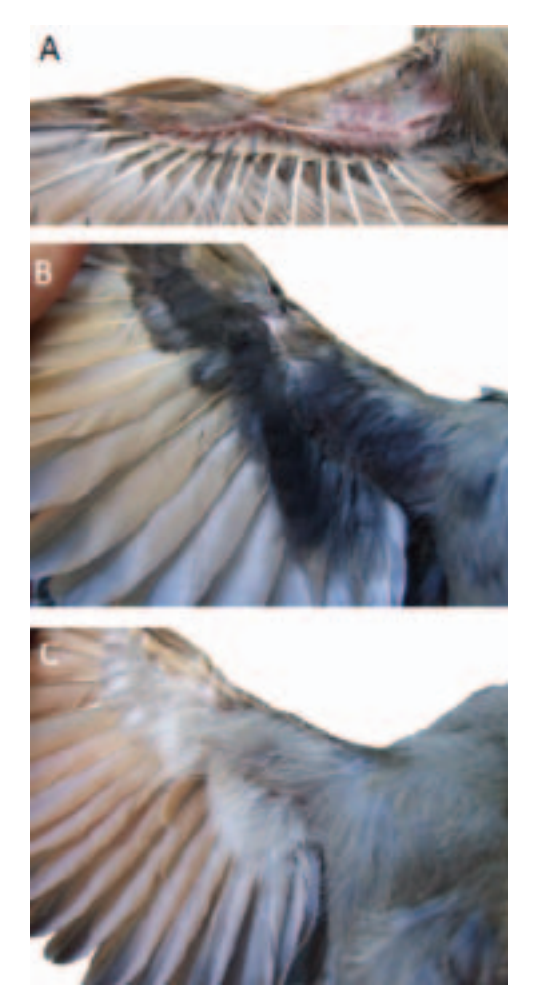
FIG. 2. View of Screaming Cowbirds underwing coverts at (A) 35 and (B) 52 days of age and view of Baywings underwing coverts at (C) 45 days of age.

molted 26-40% of the feathers (Figs. 1). The molt of primary feathers began at 57 days of age with P1 (range: 52-71 days, Fig. 1B) and finished with P9, while the molt of secondary feathers started from S1 to S5 and from S9 to S5 at the time primary 5 (P5) was molting (Fig. 3A).