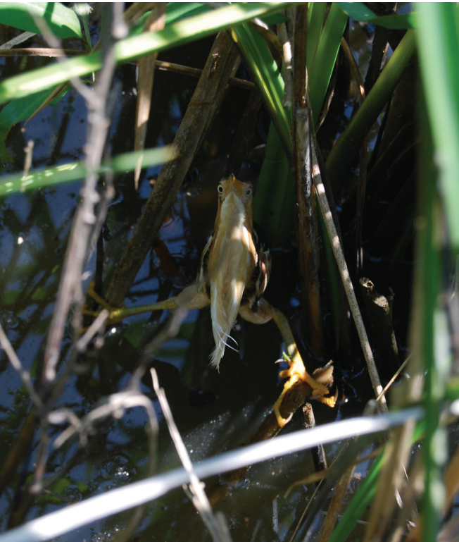
Figure 3. Least Bitterns are secretive marsh birds and were most often detected by flushing or observation deep in vegetation.

Although the occupied marsh site was small, approximately 2.3 acre (approximately 1 ha), the density of Least Bittern nests was quite high at 2.0 nests per acre (5 nests per ha). Least Bitterns are not typically colonial nesting species (Figure 3); nests are not in close proximity (Poole et al. 2009), and nest densities are typically <1 nest per acre (Kushlan 1973, Poole et al. 2009). Higher densities of nests have been reported when habitat conditions are apparently optimal for the species. Densities of 1.2-6.1 nests per acre (1-15 nests per ha) have been reported in Iowa (Kent 1951, Palmer 1962, Weller and Spatcher 1965), 1.2 to 4.9 nests per acre (3-12 nests per ha) in South Carolina (Post 1998), and an exception of 171 nests per acre in an extreme situation in Florida (Kushlan 1973).