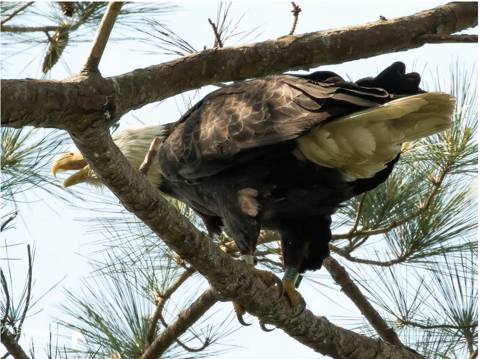
Figure 1. An adult Bald Eagle with leg bands was observed at Clay Bay, Stewart County, Tennessee in May 2019.