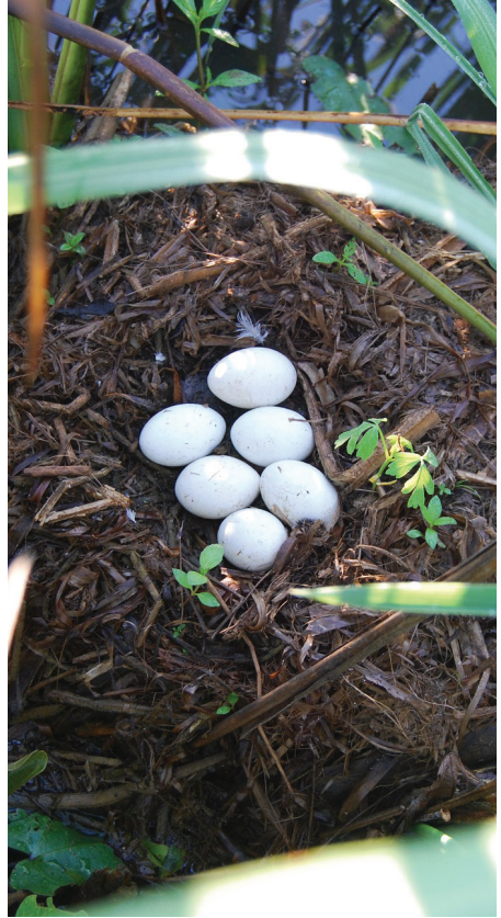
Figure 2. Pied-billed Grebe nest in relatively small numbers across Tennessee; this nest with 6 eggs was documented at Black Bayou Refuge, Lake County, Tennessee.