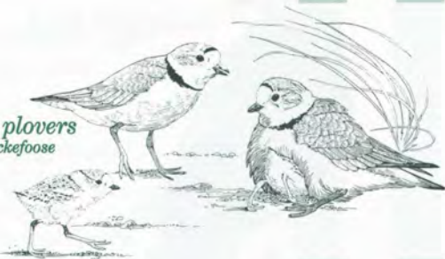
Piping plovers