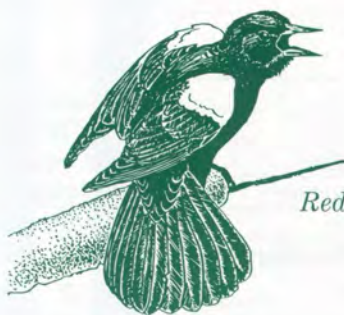
Red Winged Blackbird