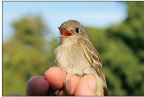
Dusky Flycatcher, Glynn Co., 1 October