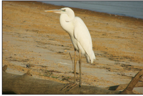
Great Blue Heron, Cherokee Co., 22 September