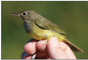
Connecticut Warbler, Glynn Co., 20 October