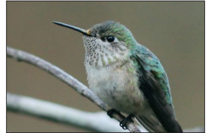
Calliope Hummingbird, Cobb Co., 18 November