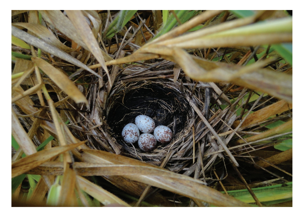
FIG. 1. Nest and eggs of Grassland Yellow-Finch (Sicalis Inteola).