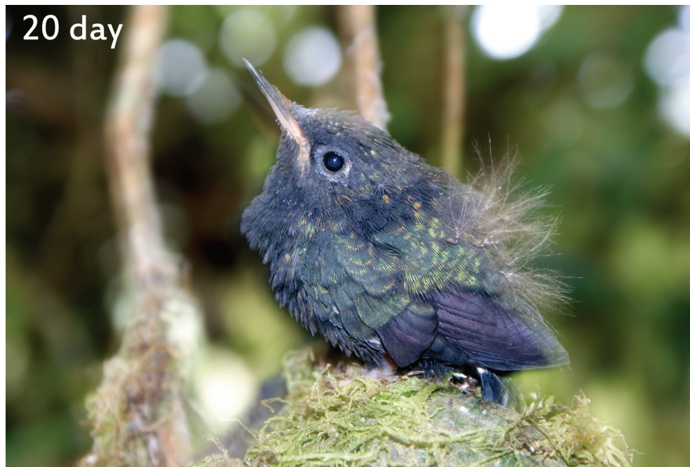
FIG. 4. Collared Inca nestling at 20 days of age, 1 day prior to fledgling.