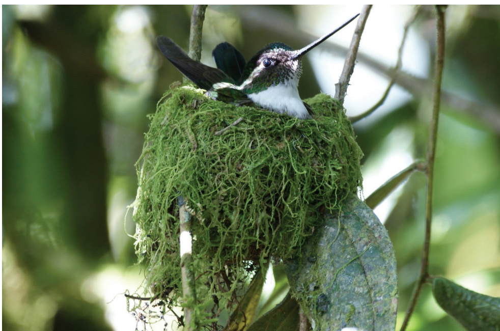
FIG. 1. Female Collared Inca incubating.