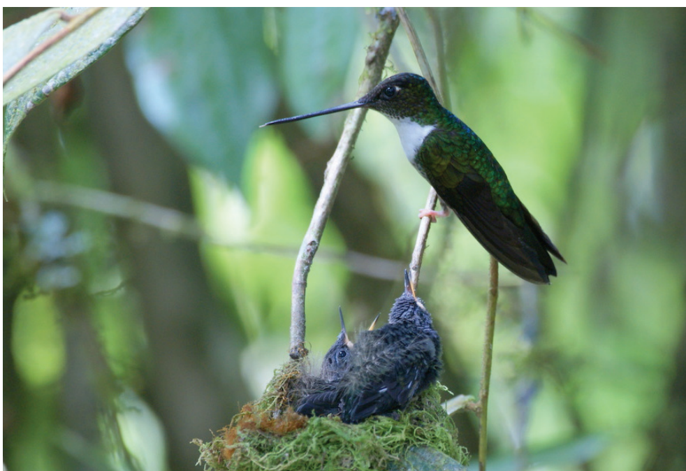
FIG. 2. Collared Inca female and two nestlings at 19 days of age.