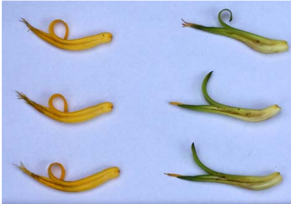
FIG. 1. Three fresh flowers of Heliconia tortuosa (left) and H. beckneri (right) picked at Cloudbridge Nature Reserve, Costa Rica, in July 2005.

ble and probably its forehead (Fig. 2C). The Violet Sabrewing usually fed whilst hovering, and rarely perched to feed. At H. tortuosa flowers the anthers and stigma appeared to touch the forehead or crown (Fig. 2D). Trial observations at a large clump of H. beckneri plants in secondary growth suggested that the anthers and stigma of this species touched the bird's chin. It should be noted that there is no quantitative data to support these observations of differing feeding methods, and no additional fieldwork was carried out to confirm the pollen deposition sites.