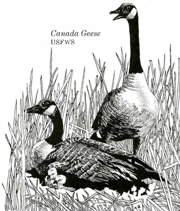
Canada Geese