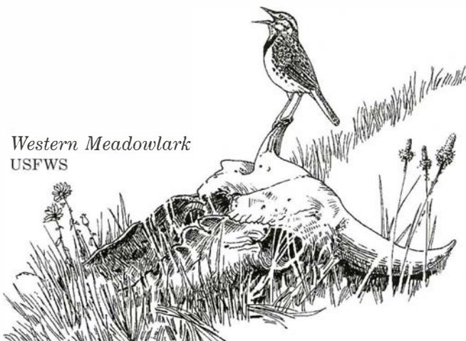
Western Meadowlark