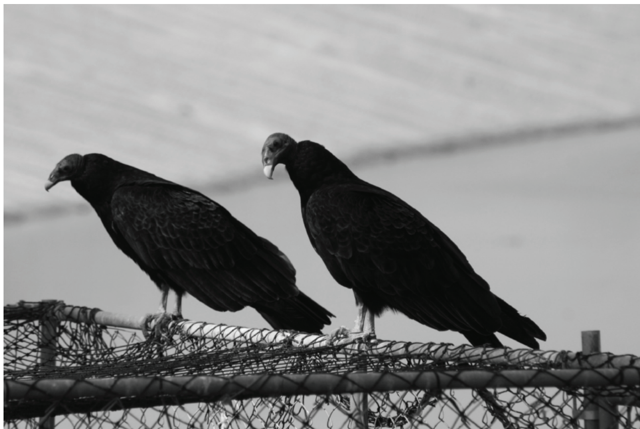
Figure 1: Turkey Vultures usually land and gather around or on top of the cage before entering. Other Turkey Vultures from the distance detect this behavior.