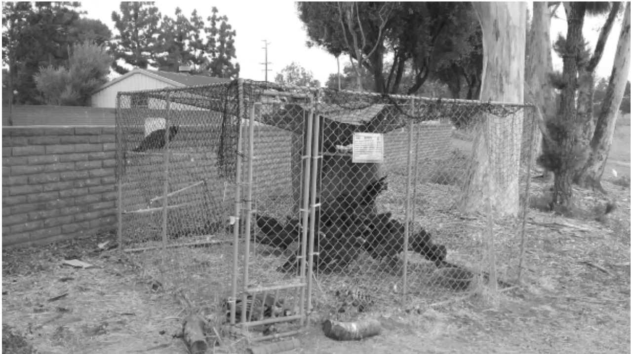
Figure 3: Thirteen Turkey Vultures inside the chain link pet kennel converted into a Walk-in trap and waiting to be tagged and sampled.