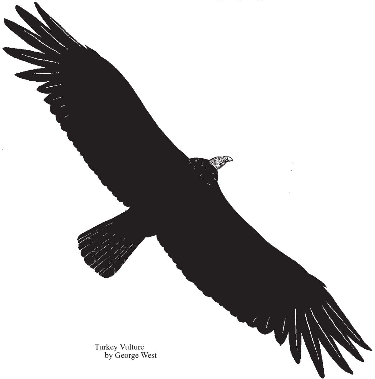
Turkey Vulture