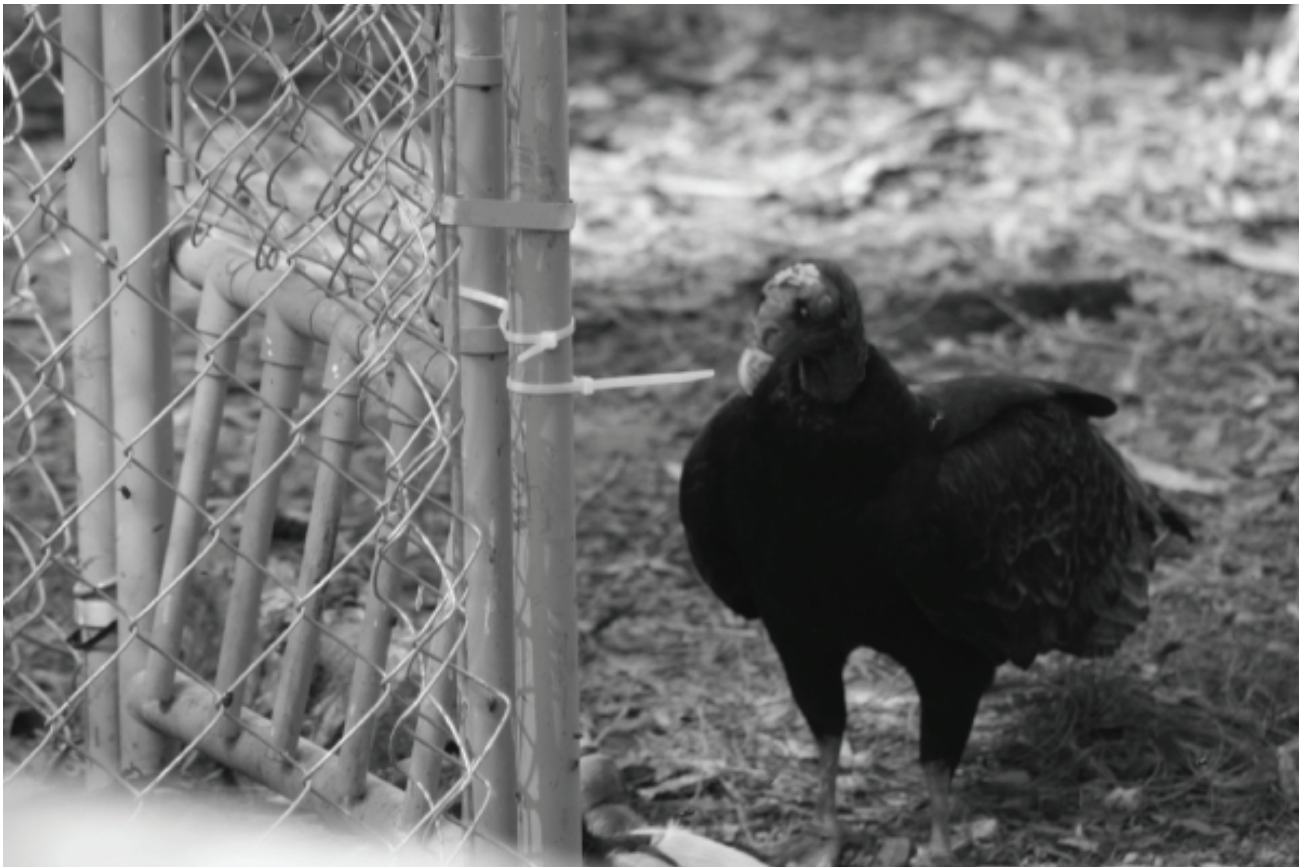
Figure 4: A modified entry door allows Turkey Vultures to enter but not to exit.