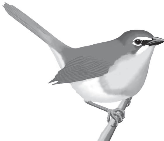
Yellow-breasted Chat