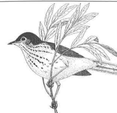
Swainson's Thrush by George West