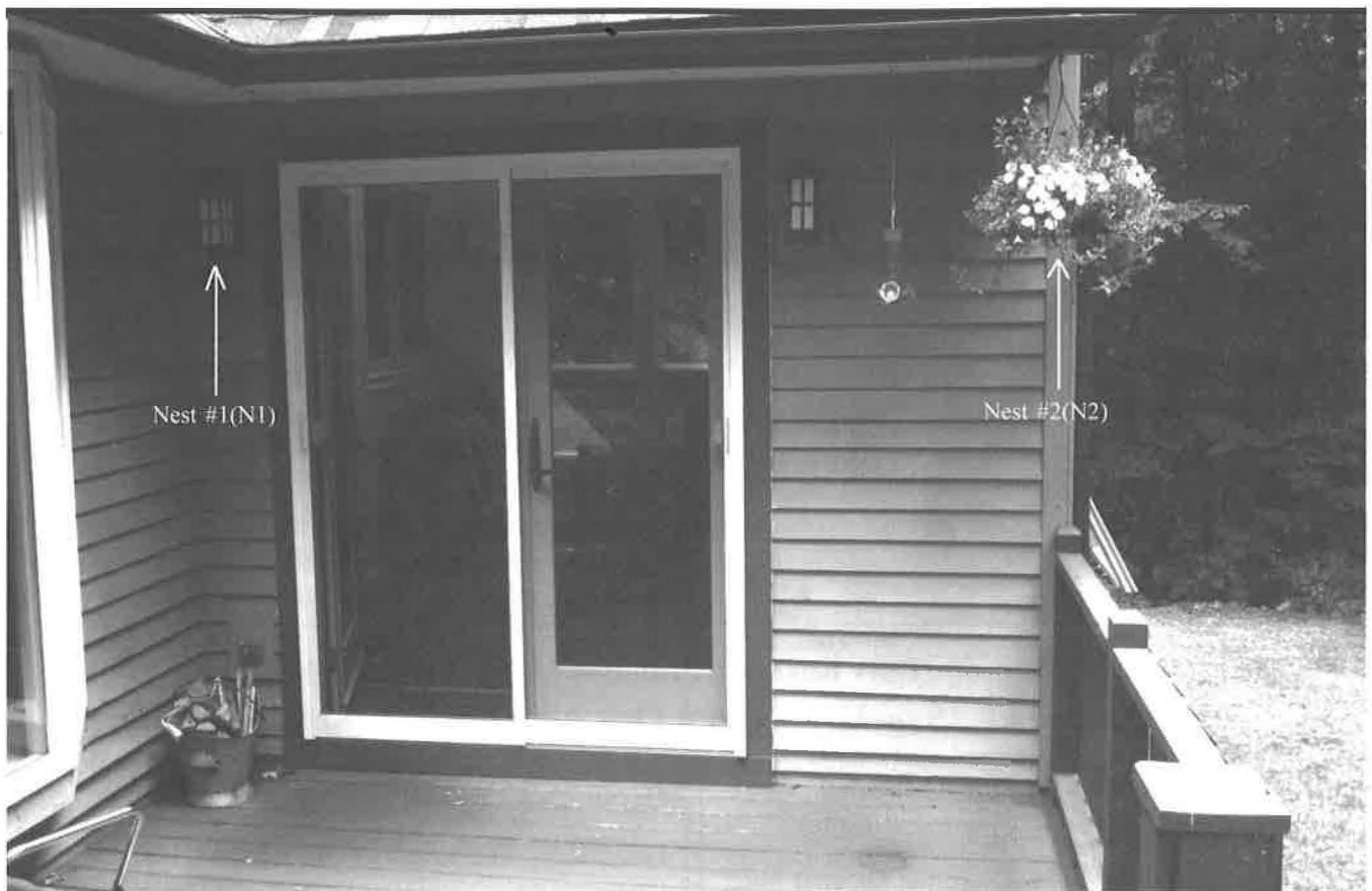
Fig. 1. Photograph of deck where Phoebe nests N1 and N2 occurred, 5 Jul 2016.

N1 was discovered 2 May 2016 and successfully fledged four young on 18 Jun. On 5 Jul it had another clutch of four eggs. The planter containing N2 was put in place on 12 May and the nest discovered on either 17 or 18 May as the phoebe flushed from it when the planter was taken down for watering. On 23 or 24 May the planter was again taken down for watering, the nest contained four very lightly brown-speckled white eggs which were missing on 30 May. The condition of the slightly disheveled nest suggested it had been raided perhaps by a red squirrel ( Tamiasciurus hudsonicus ) which could have accessed it via a roof drain pipe immediately adjacent the hanging planter. On 5 Jul the nest remained abandoned.