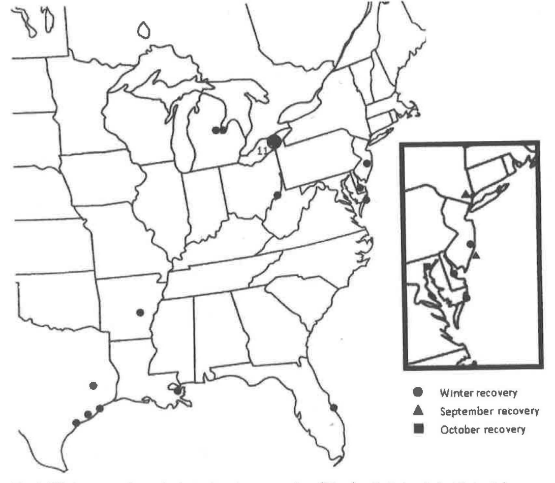
Fig. 1. Winter recoveries and select migration recoveries of Herring Gulls banded at Lake Erie.

The winter recoveries were concentrated in the following three areas: eastern Lake Erie (11 birds), the west end of the Gulf of Mexico (4 birds) and the Chesapeake Bay/ New Jersey coast (3 birds; see Fig. 1). Although recoveries were concentrated in these areas, gulls within these areas were encountered randomly throughout the 34 years of data collection. The remaining six birds were recovered one each in Florida, Texas, Arkansas, and Ohio and plus two in Michigan. All recoveries were associated with large bodies of water, such as oceans, the Great Lakes or large lakes or rivers.