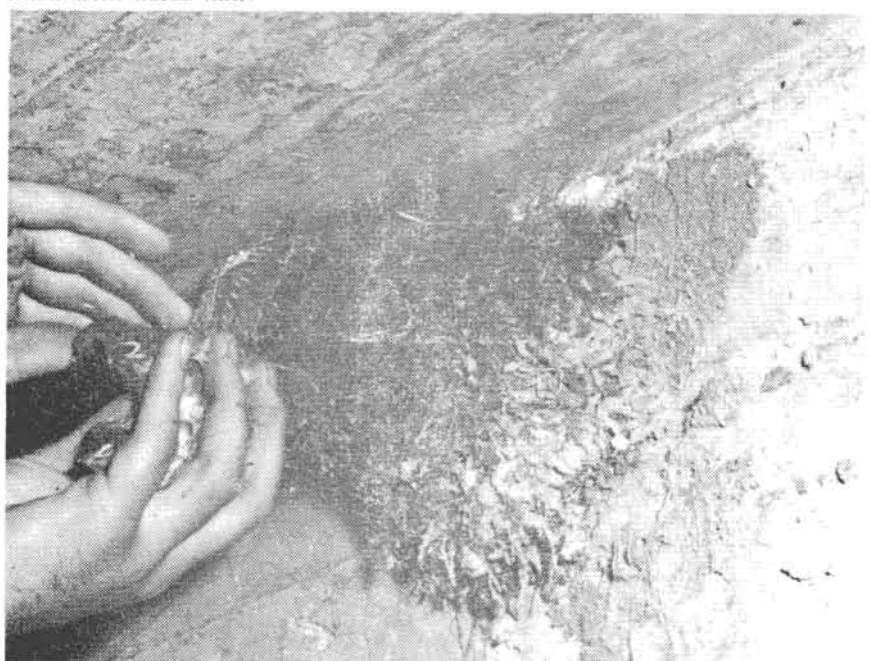
Nest and young Eastern Phoebes under bridge.

than one brood still maintained a green outer cover. The lining differs with location and availability of materials. For instance, it was always noted that in wooded and mountainous areas the nests were lined with dried grass. On the other hand, nests located in farming country were lined with horse hair.