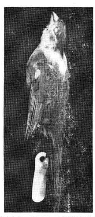
ADULT ALBINO GRACKLE PIEBALD FEMALE CARDINAL