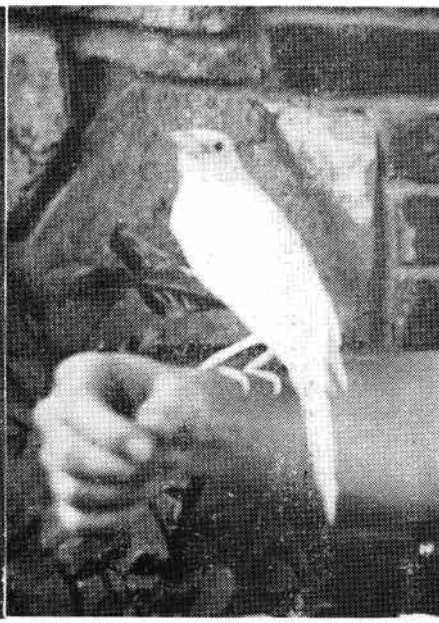
YOUNG ALBINO GRACKLE