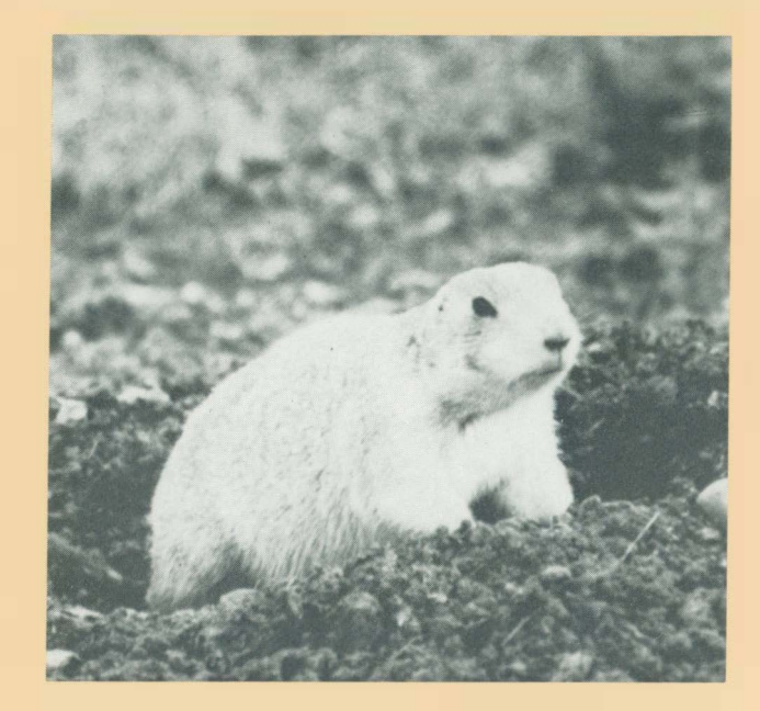
Prairie dogs, a burrowing rodent, are found in towns and are characterized by their barking when alarmed.