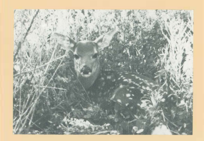
Mule and white-tailed deer are common refuge residents.