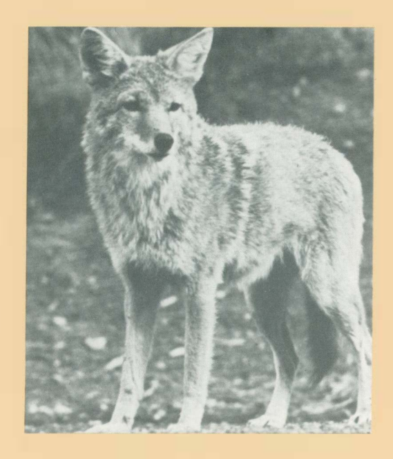
Coyotes are found throughout the refuge and their howling may be heard during twilight hours.

About 236 species of birds have been identified in the area since 1936. Double-crested cormorant and great blue heron rookeries occur on islands and in flooded timber along Fort Peck Reservoir. Many species of raptors, such as golden eagles, prairie falcons, ospreys, and American kestrels nest on the refuge. Each spring sharp-tailed grouse gather on traditional dancing grounds or "leks" and begin their courtship rituals. Armed with binoculars and a bird guide, a visit to the refuge will provide a rewarding experience to the novice as well as the expert birder.