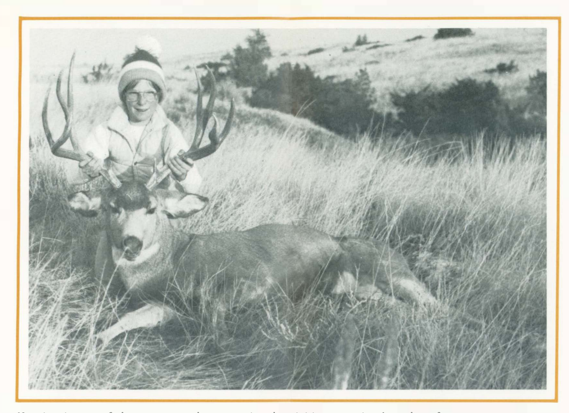
Hunting is one of the many popular recreational activities permitted on the refuge.