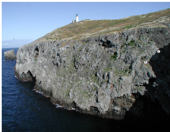
Fig. 3. Landing Cove Cliffs and Lighthouse, East Anacapa Island, and the approximate locations of Cassin's Auklet nests found in May 2008 (1, 2).