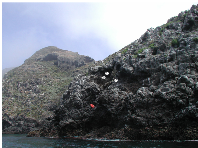
Fig. 2. Rat Rock, West Anacapa Island, and the approximate locations of Cassin's Auklet nests found in May 2003 (1, 2) and March 2009 (3).

The first documented nesting of Cassin's Auklet in 2003 and subsequent growth of a small population from 2003 to 2012 has demonstrated additional unexpected benefits of rat eradication for