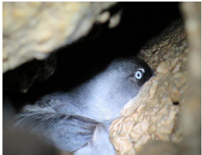
Fig. 4. Incubating adult Cassin's Auklet in nest #2 on Rat Rock, West Anacapa Island. Note the white iris typical of breeding adults and older subadults.

Thus far, most auklet nests at Anacapa have been found in rock crevices, but continued population growth for auklets and other crevice-nesting seabirds will eventually limit the availability of suitable crevices in current breeding areas. Some additional colony growth is possible at Rat Rock, Landing Cove, the Lighthouse, Portuguese Cove, and to a lesser extent Garbage Cove, where suitable vacant nesting crevices are still available. Little growth is expected on Cat Rock because of its small size