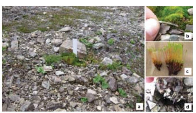
Fig. 2. (a) Example of non-active Kittlitz's Murrelet nest site at Agattu Island, Alaska; (b) bone found among mosses; (c) Tetraplodon mnioides moss collected from nest scrape; and (d) Kittlitz's Murrelet egg shell fragments found in nest scrape.

While searching alpine areas at Agattu for active Kittlitz's Murrelet nests, we used these vegetative cues to locate old or "non-active" Kittlitz's Murrelet nest scrapes, defined as a nest site that had been used in a previous breeding season, but was not monitored during the research period. Non-active nests were confirmed by the presence of egg shell and/or chick remains in the nest scrape. Over three fields seasons (2009–2011) we located 74 non-active Kittlitz's Murrelet nests in the mountains at Agattu (unpublished data). Based on observations at Agattu, re-use of a nest site is rare, with <5% (four of 87) of nests re-occupied in subsequent years. Although speculative, because we did not capture and mark adults at nests, Kittlitz's Murrelets appear to exhibit nest area fidelity, and active nests have been discovered ranging from 2 m to 100 m from nests found in previous years (Kaler et al. 2010). Thus, searching a