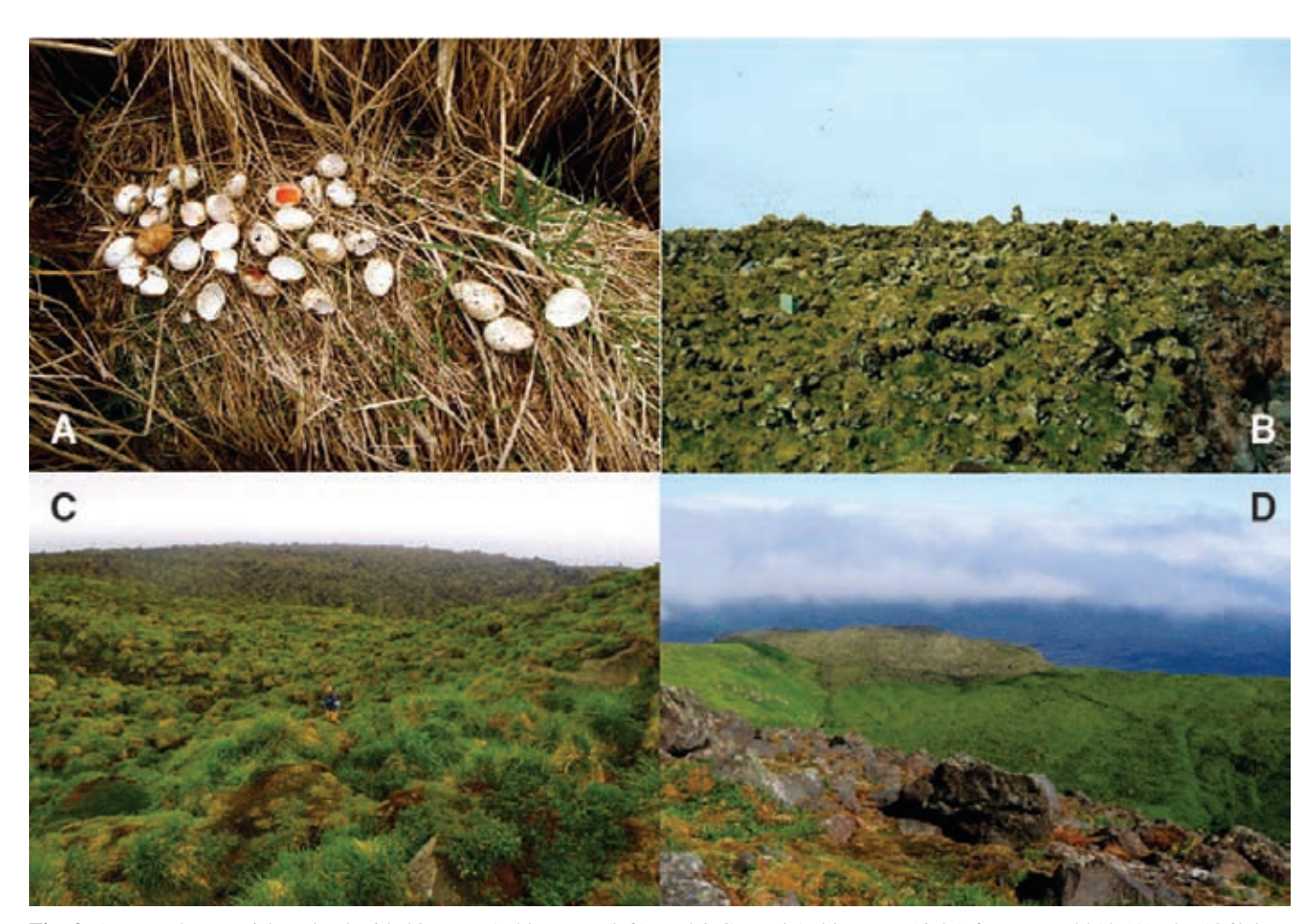
Fig. 2. A rat cache on Kiska Island with 29 Least Auklet eggs (left), and 3 Crested Auklet eggs (right) from June 2010 (A), the 1969 lava dome (B), Bob's Plateau (C), and entire auklet colony (D).