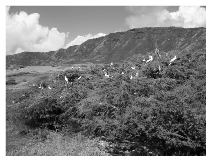
Fig. 2. Example of high-density nesting of Red-footed Boobies in the central portion of kiawe trees at the lower-elevation area of the nesting colony. High winds are hypothesized to have destroyed nests on outer branches.