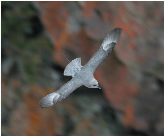
Fig. 1. A Northern Fulmar Fulmarus glacialis equipped with a satellite transmitter. Note antennae extending from just anterior to the tail, and that the transmitter is completely covered by back feathers.

In 2005, to minimize the risk of abandonment, we paid greater attention to capturing birds when both members of the pair were present at the nest during incubation (i.e. one mate would stay at the