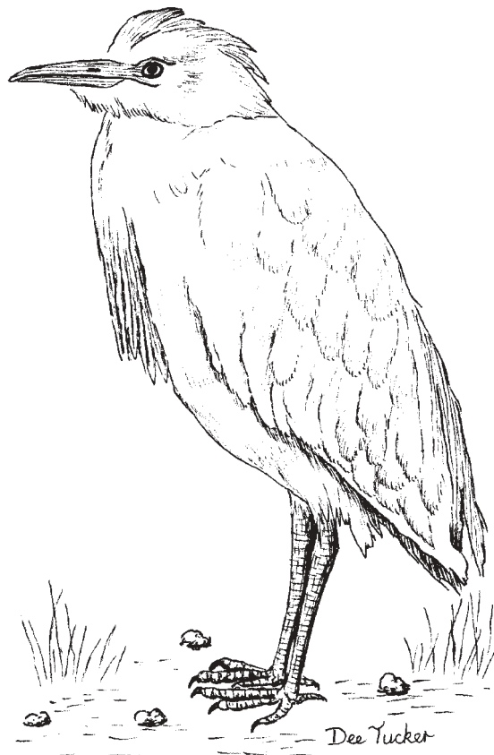
Cattle Egret by Dee Tucker (Harrison, J.A. et al. 1997. The atlas of southern African birds )