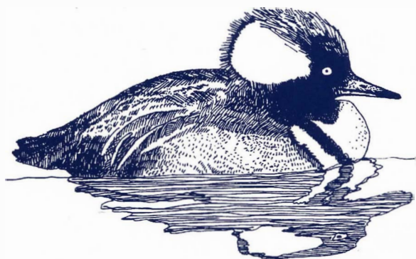
Male Hooded Merganser

The Patuxent Research Refuge offers rewarding opportunities for bird observation throughout the year. Late April through mid-May is the best time to observe migrating warblers. Waterfowl numbers are highest on the refuge during winter, but the greatest variety of waterfowl species are present in mid-March and mid-October.