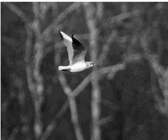
Black-headed Gull in flight.

Kevin Graff relocated the Mew Gull on the morning of December 26. However, for other birders, the gull proved tantalizingly elusive.