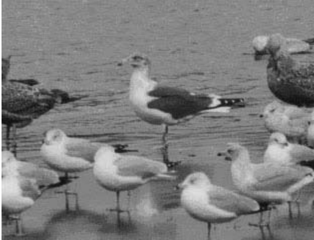
Lesser Black-backed Gulls are regular winter visitors to Schoolhouse Pond. An adult is shown.