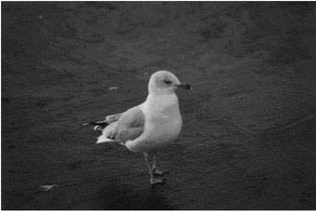
A Ring-billed Gull comes in for a closer look.

Also present was an adult Glaucous Gull. This beautiful gull kept our attention for some time, as we studied its various field marks. It appeared to be a smallish Glaucous Gull, similar in size to some of the Herring Gulls. However, the wing tips were all white, even when extended. A very pretty gull! Although 1st winter Glaucous Gulls have been reported at the pond from time to time, an adult was quite unexpected.