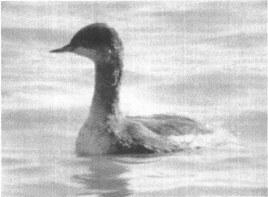
Eared Grebe (92-01)

A fairly typical set of records for a species known to be a rare but regular migrant and winter visitor in eastern North America, where the majority of reports occur between October and April (Buckley 1968, Banks and Clapp 1987). The number of Maryland reports has increased steadily since 1967, with most from the Coastal Plain. Reports of Eared Grebes from the Coastal Plain and Piedmont of Maryland are no longer reviewed by the committee.