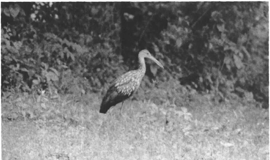
Limpkin (88-26)

These records represent the most northerly occurrences of Limpkins in North America (AOU 1983). The similarity of dates, separated by 14 years, is remarkable.