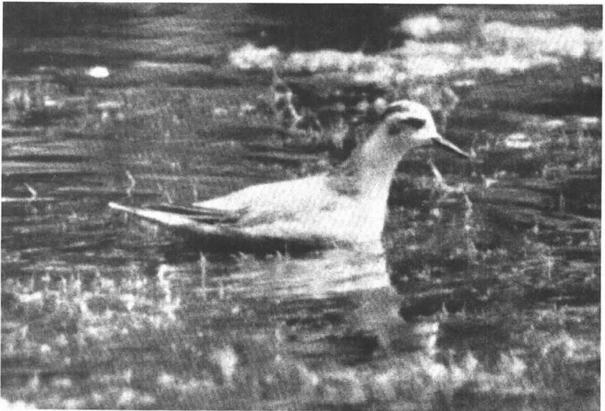
Red Phalarope (92-23)

The 14 August date from Hart-Miller Island is exceptionally early for an inland migrant during autumn; the other dates are more typical for fall migration. While it is a regular migrant offshore, this species remains the rarest phalarope within inland counties. The committee no longer reviews reports from the Coastal Plain and Piedmont.