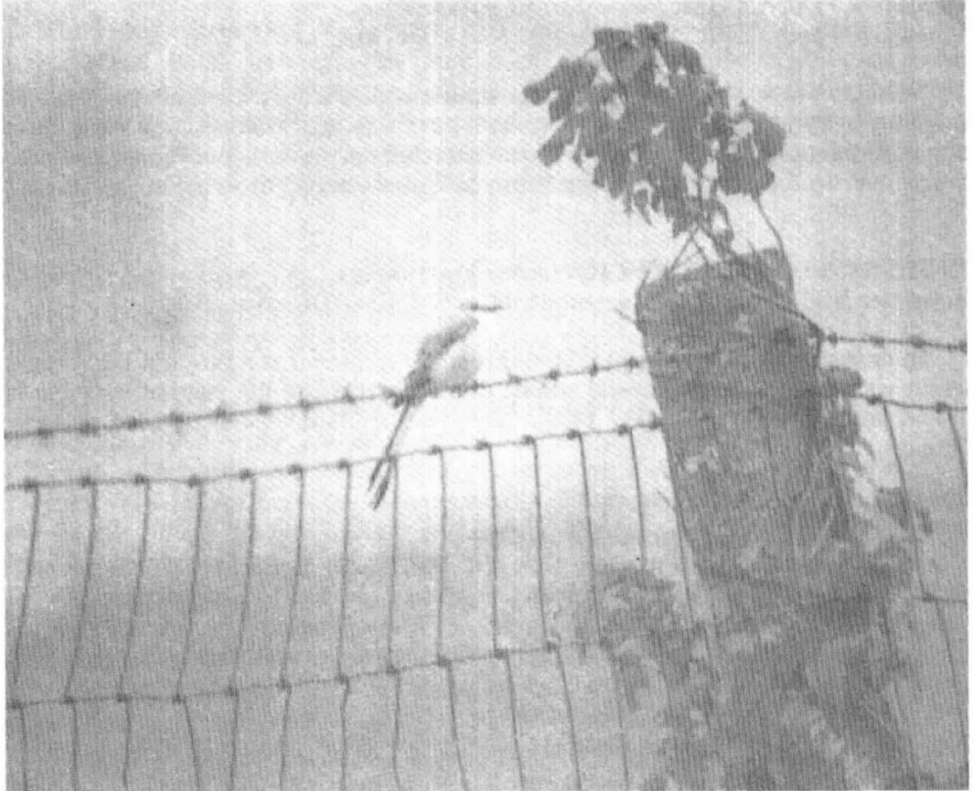
Scissor-tailed Flycatcher (88-06)