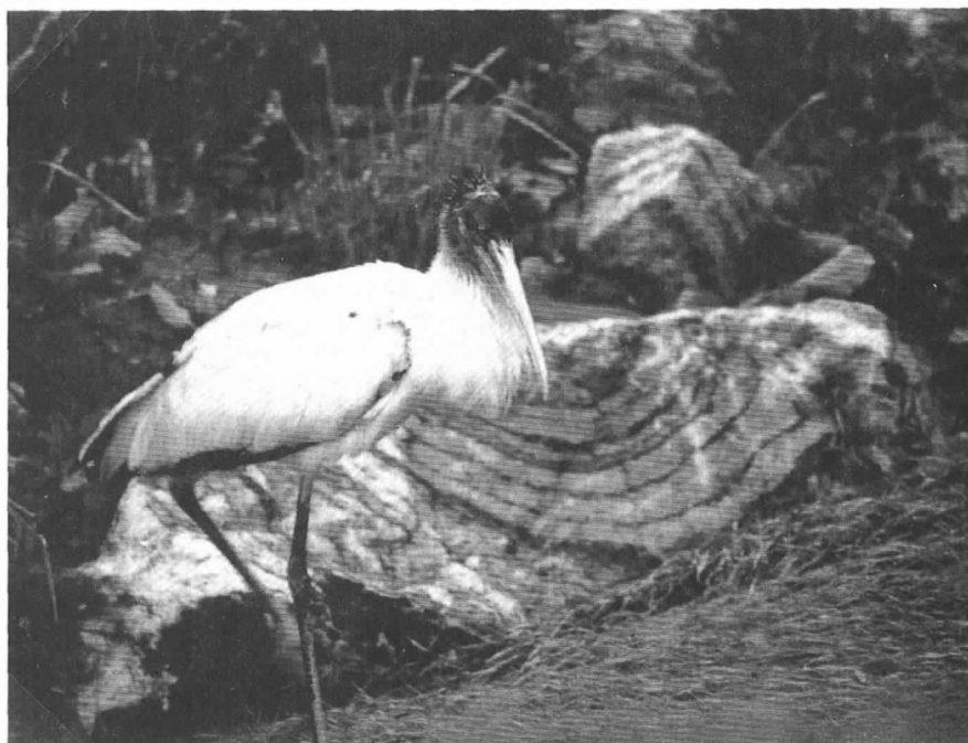
Wood Stork (90-08), Photo by David Czaplak

Along the Mid-Atlantic coast, Wood Storks are known primarily as post-breeding visitors with most sightings between late June and mid-August. These two records represent typical dates. The number of extralimital Wood Stork sightings has noticeably decreased during recent decades, reflecting declines in breeding populations in the southeastern U.S.