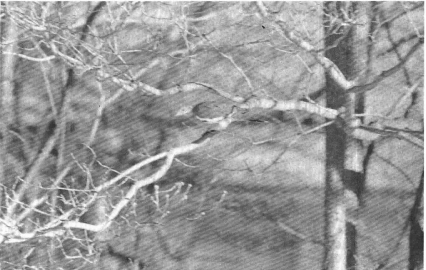
White-winged Dove (90-11)