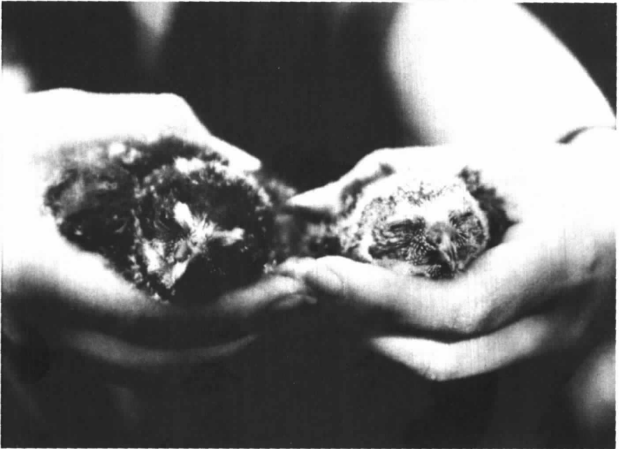
Figure 3. Two Northern Saw-whet Owl chicks from Cranesville Swamp nest box on 29 May 1993. Chicks are approximately 15 and 12 days old.

She did possess obvious remnants of a brood patch. While holding the female, the box was opened to reveal 2 young (Figure 3) and 2 addled eggs. The mass of the smaller and younger of the 2 owlets was 76 g, its 4th primary measured 20 mm, this feather had not yet broken through the sheath, and its eyes were barely open. The mass of the older owlet was 105 g, its 4th primary measured 30 mm, and it had broken through the sheath. Based on primary measurements and mass, we estimated the age of the young to be 12 and 15 days (see Cannings 1987). Prey cached in the box consisted of 1 adult and 1 immature deer mouse ( Peromyscus sp.) and 1 Red-backed Vole ( Clethrionomys gapperi ). Following measurement and banding, the owlets were returned to the box, it was closed, and the female was returned to the box. She did not flush from the box and, after a few moments, proceeded to watch us from the box entrance as we departed.