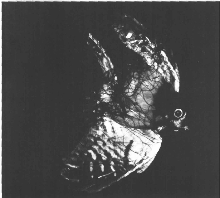
Figure 1. Second juvenile Northern Saw-whet Owl banded in Maryland. This owl was netted on 30 June 1992 near Cunningham Swamp, Garrett County, Maryland. The out-of-focus smudge in the lower left hand corner of the photograph is an adult Northern Saw-whet Owl, presumably the juvenile's male parent.

The following night, 29 June 1992, the Casselman River net setup was moved to a location near Cherry Creek and another identical setup was erected near Cunningham Swamp. Singing Northern Saw-whet Owls had been present on several nights during each of the previous two springs at both of these locations. Between approximately 22:00, 29 June, and 00:30, 30 June, two Northern Saw-whet Owls were netted near Cunningham Swamp, an adult, presumably a male (mass 82 g, wing chord 129 mm, flattened wing 138 mm) because of a relatively short wing chord measurement, and a juvenile, presumably a female (mass 92 g, wing chord 142, flattened wing 146, tail 77 mm) because of a relatively long wing chord measurement. The adult had molted all the primaries on both wings, secondaries 1 to 8 were new, while secondaries 9-12 were actively growing but still sheathed. All tail feathers appeared to have been dropped relatively simultaneously as all were growing in, approximately the same length and still sheathed. No evidence of a brood patch was present.