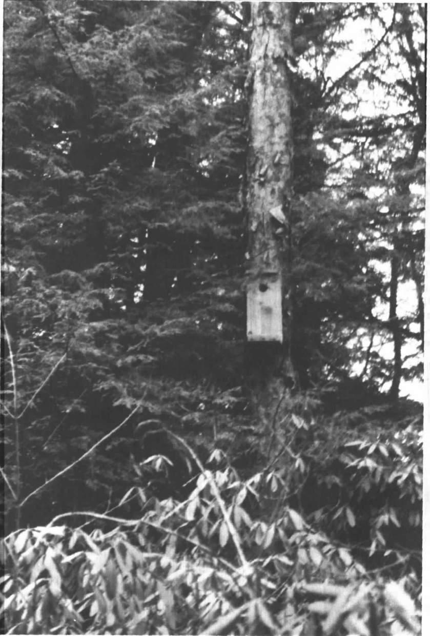
Figure 4. Tall nest box in West Virginia portion of Cranesville Swamp, Preston County, where depredated Northern Saw-whet Owl nest was found.