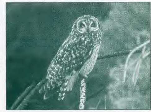
Puae (Hawaiian Owl)

This sign is posted along Maulua Road which is the only access for four-wheel-drive vehicles.