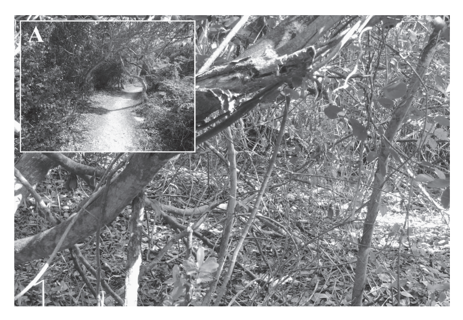
Figure 2. The dense vegetation of the hardwood hammock where the Swainson's Warbler was found. A) Respective habitat along the Golden Orb trail.

the Cape Florida Banding Station in 2006 most likely wintered in this area, although a final confirmation was not achieved (Robin Diaz, pers. comm.). This bird was banded on 29 September 2006 and thereafter recaptured six times until 3 November 2006, and then again on 12 March 2007. According to Robin Diaz (per. comm.), each time the bird was recaptured, its fat score was at the lower end but its muscle score at the higher end of the scale, indicating a healthy individual which was not in a migration mode (i.e. with high fat score), but its whereabouts between November and March remain unproven. However according to Stevenson and Anderson (1994), its last capture in fall was within the migratory period of the SWWA, whereas its first recapture in spring was just three days before the earliest recorded arriving day of SWWA in Florida (15 March). From this, a record in mid January would be the best evidence for a wintering bird in Florida.