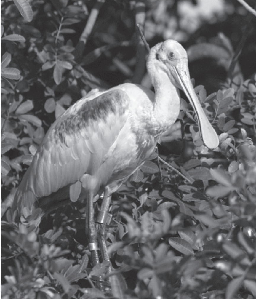
Figure 3. Roseate Spoonbill 5H, banded at the Richard T. Paul Alafia Bank Bird Sanctuary in 2006.