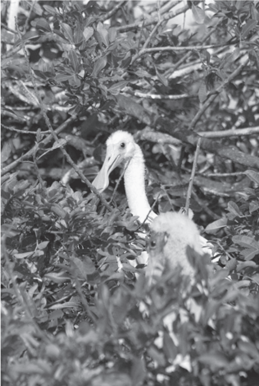
Figure 2. Spoonbill chick (Stage II) on 20 June 2009.