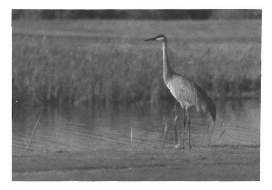
Figure 1. Florida Sandhill Crane nest site on Sebastian Municipal Golf Course fairway. Note a single egg lying next to adult crane's feet.

On the morning of 14 March 1990, I investigated a report of a Sandhill Crane nesting on the ninth fairway of the Sebastian Municipal Golf Course in northern Indian River County, Florida. At a distance of 50 m I saw the cranes guarding a single egg lying on the manicured fairway grass devoid of a nest structure (Fig. 1). From only 2 m away I detected the presence of a few scattered sticks, sedges, and feather down placed in a desultory