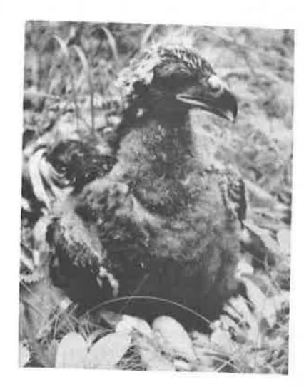
Above: Youngster with injured foot. Left: Sergej and eaglet near Chrystal Lake.

For the moment we were hung up on the stone, but freed ourselves and continued across without further mishap - a little shaken by our experience, but none the worse for wear.