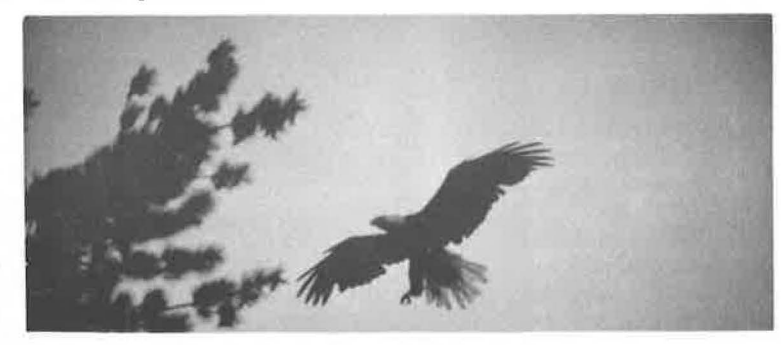
"Papa" Eagle returning to nest

Just then, I happened to glance skyward and there at about 1.00 o' clock from me, coming in a gentle stoop toward the aerie, was the unmiskable form of old "papa" eagle with a red squirrel in tow, evidently quite unaware of our presence.