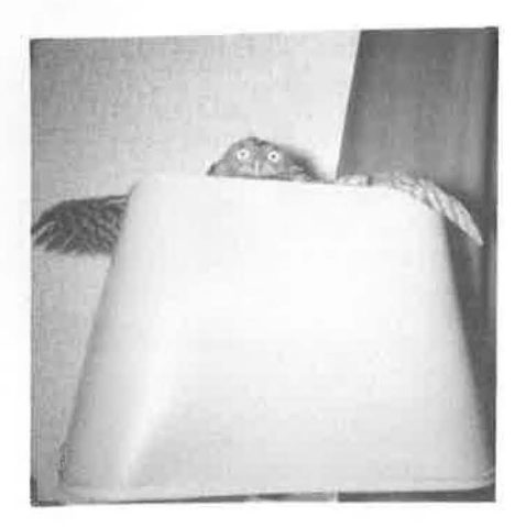
(5) "No, Squeaky, you gotta really throw yourself into it!"